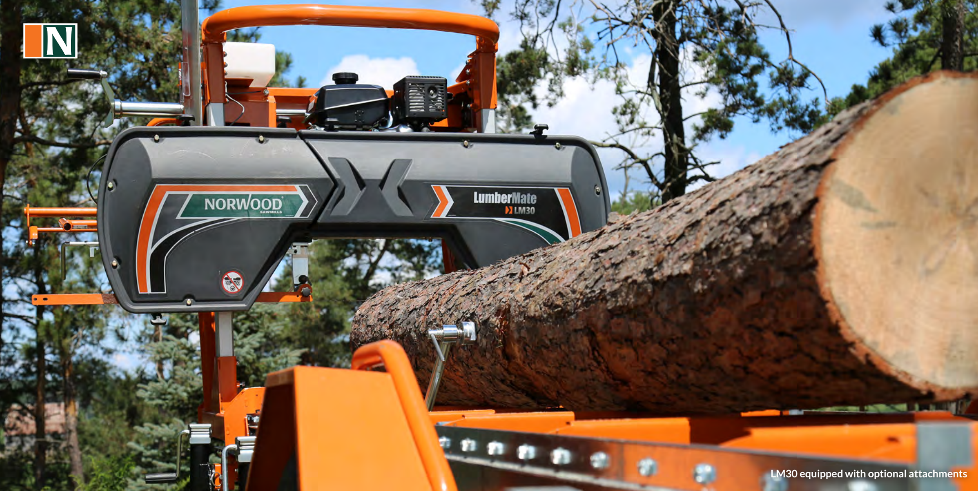
LM30 equipped with optional attachments