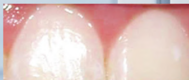
Four weeks later