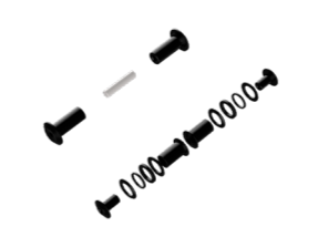
SET 4 LOWER LINK KIT 24