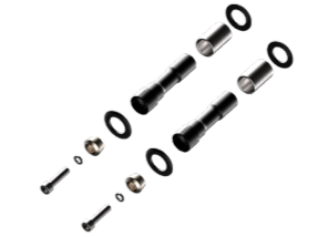
SET 5 HANGER M068 + NUT