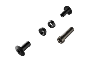
SET 3 UPPER LINK KIT 26