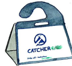
3. Fasten the trap