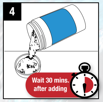
Add sufficient sanitizer (Chlorinated Granules)