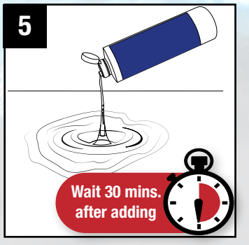
Add clarifiers as required Use a sequestering agent for hard water (Stain & Scale Control), or a flocculant (Spa Clear or Foam Free) as needed