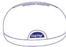
LTI-HID Not Included