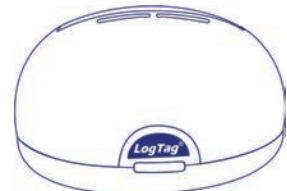
LTI-WiFi Not Included