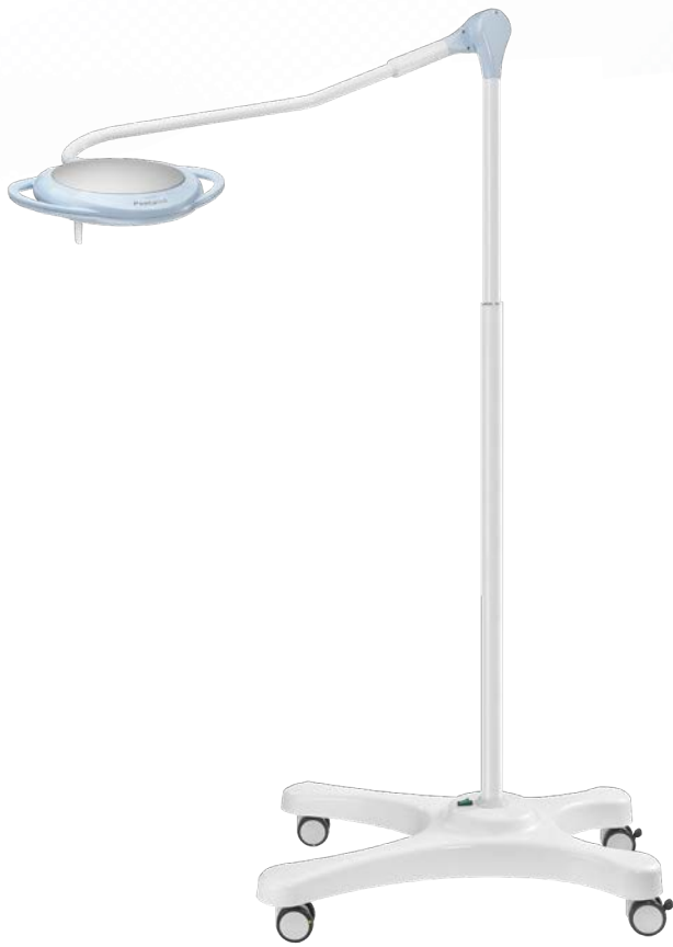
-MOBILE Pentaled 12 mobile (code PENTA12PI)