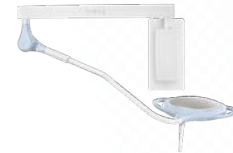
-WALL MOUNTED Pentaled 12 wall (code PENTA12PA)