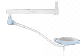
-CEILING SINGLE Pentaled 12 ceiling (code PENTA12SO)