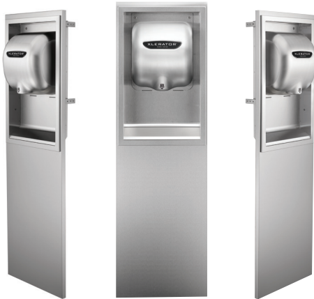
(XLERATOR Hand Dryer not included)

PART #40550 - STANDARD PART #40551 - ADA HEIGHT