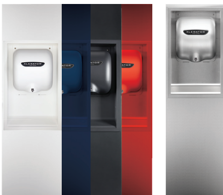
(Dryer Sold Separately)

NATIONAL INSTALLATION SERVICES AVAILABLE • CALL FOR DETAILS 800-255-9235