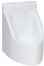
DEL CASA™ #2902