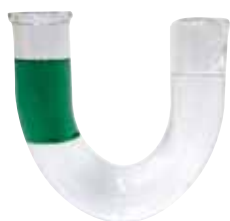
Building Side Only

Many options to eliminate odors. Add water into the trap then simply add 3-6 oz. of EverPrime depending on trap size. Or, mix water and EverPrime in a quart bottle, shake well and release bottle contents into the trapway. EverPrime will settle on both sides of the trap.