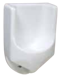
KALAHARI™ #2003 / #2003B