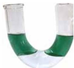
Building & Drain Sides