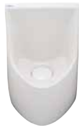
SANTA FE™ #2903