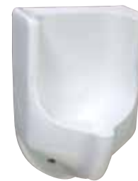
SONORA™ #2004 / #2004B