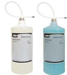
FG750389 / FG750390 FG750517 / FG750386