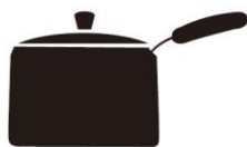
Enamel Iron Pot