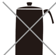
Outer Bottom Less than 12cm