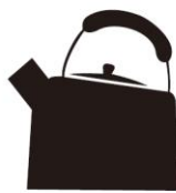
Iron or Enamel Pot