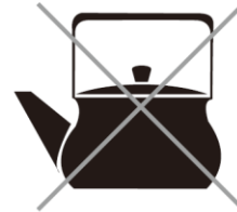
Copper Alloy Pot with Low Iron Content