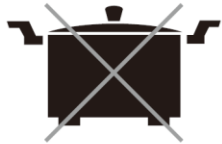
Pot with Legs