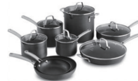
Cast Iron Cookware