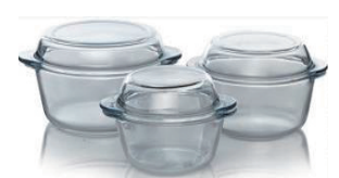
Glass or Ceramic Cookware