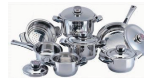
Stainless Steel Cookware