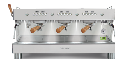
3GR Full Inox