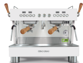
2GR Compact White&Wood