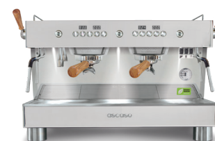
2GR Full Inox