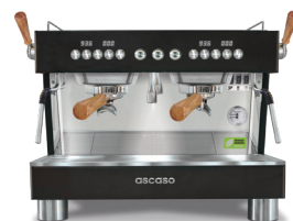
2GR Compact Black&Wood