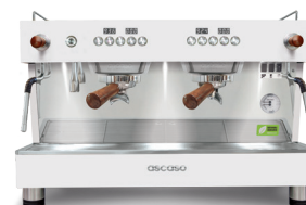
2GR Joystick B&W