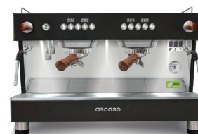
2GR Joystick B&W