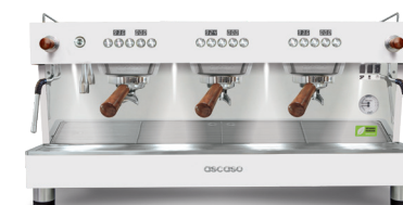
3GR Joystick B&W