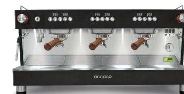
3GR Joystick B&W