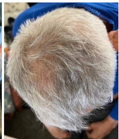
After approx. 10 Weeks