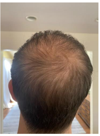
After approx. 12 Weeks