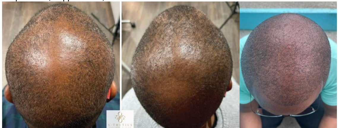
Before Celluma RESTORE

No products, supplements, or other modalities