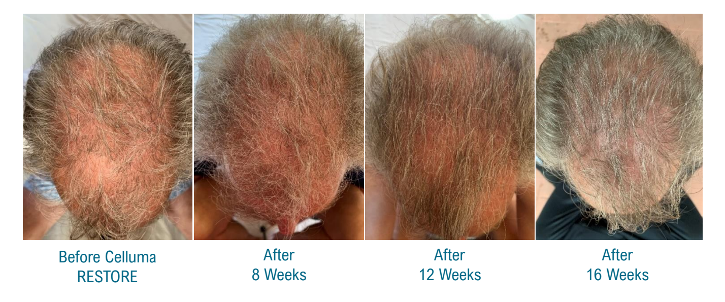
Female age 77 No products, supplements, or other modalities Each photo was taken 4 weeks after a regular haircut

Male age 60 No products, supplements, or other modalities Each photo was taken 4 weeks after a regular haircut