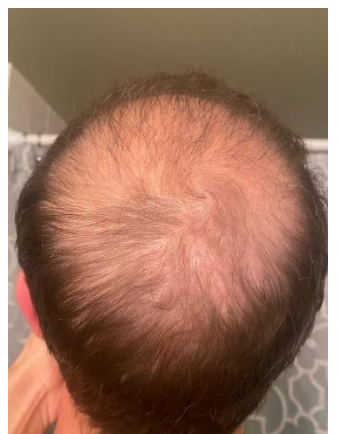
Before Celluma RESTORE (client was resistant to early use)