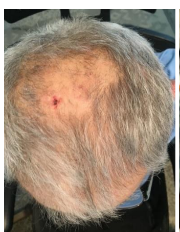
Before Celluma RESTORE