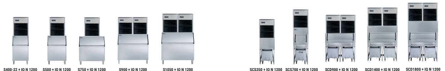
S400-22 + IQ N 1200