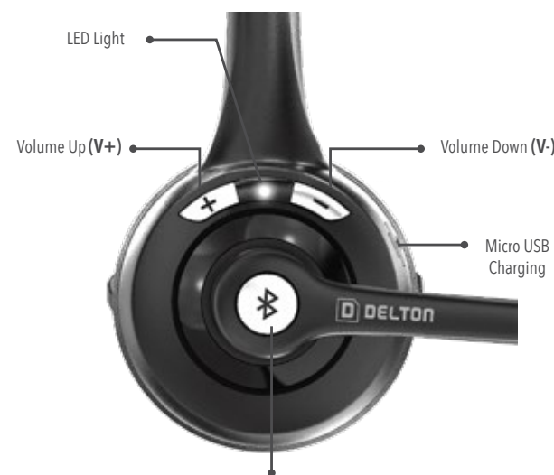
(MFB) Multi-Functional Button (Power, Answer, End Call, Redial, Play, Pause)