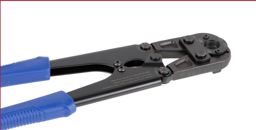
Manual Crimping Tool