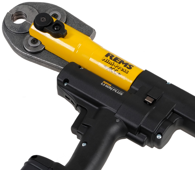
Battery Crimping Tool

Stainless ring will have three visible lines if it has been crimped correctly.