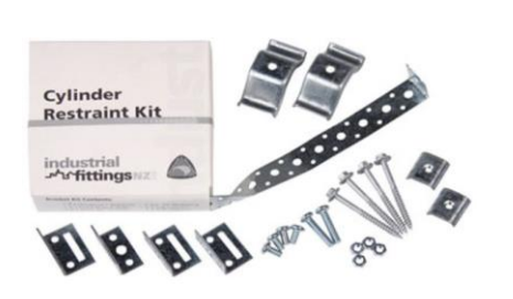
Cylinder Restraint Kit