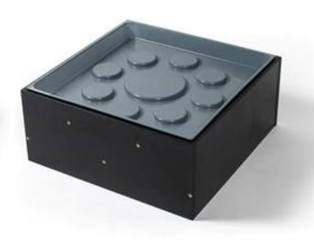
Pearl White Anthracite Grey Jet Black

Cost-effective and efficient solution to installing hot water cylinders. Designed by Kiwi tradesmen for Kiwi tradesmen.