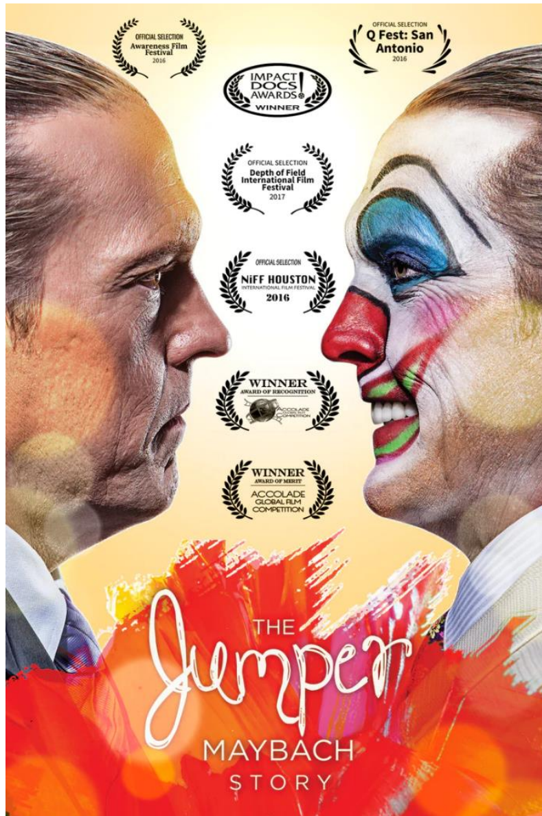
THE JUMPER MAYBACH STORY