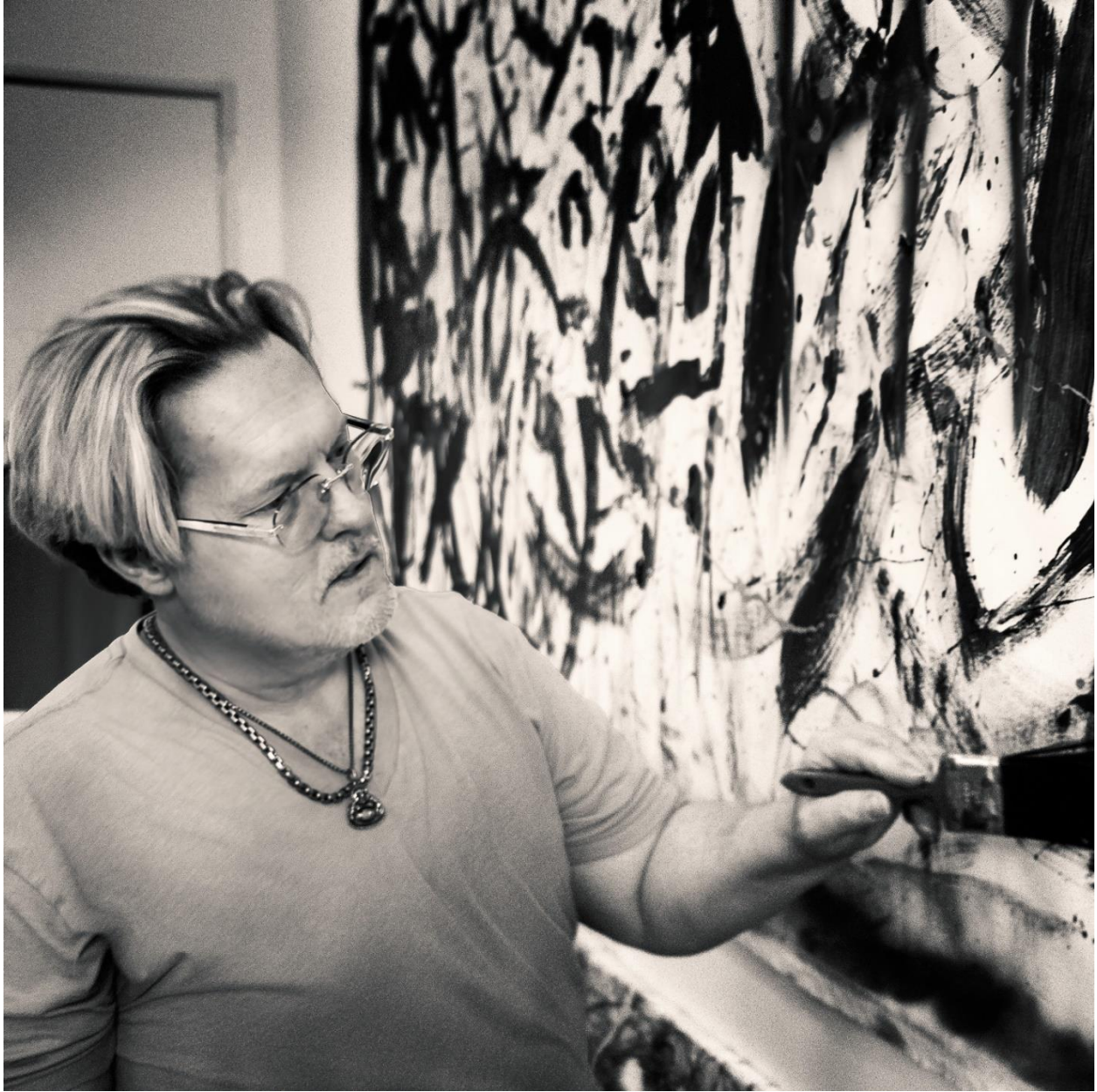
Back to the Brush 2023 The Artist In Studio