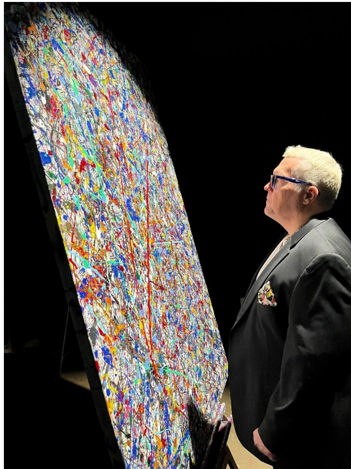
The Artist contemplates a Large Scale work

creating extraordinary works that transform the fine art world and spread his message of universal love, unconditional acceptance and the freedom to be who we are.