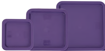
PECC-24P, PECC-68P, PECC-128P