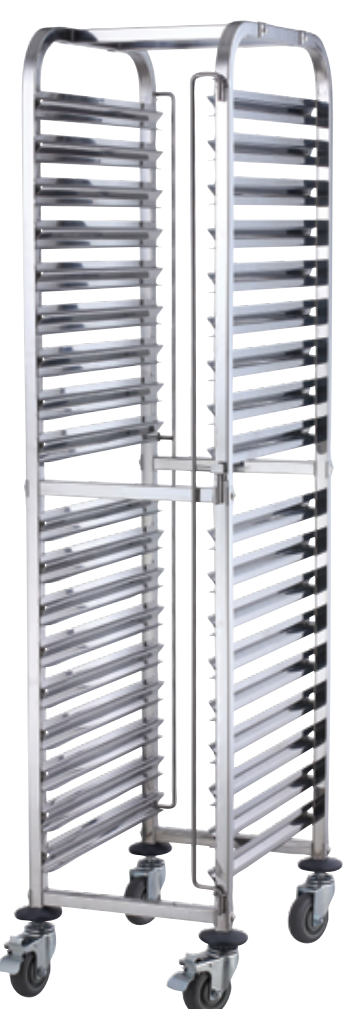
SRK-36 Fits a combination of full, half or third-size pans