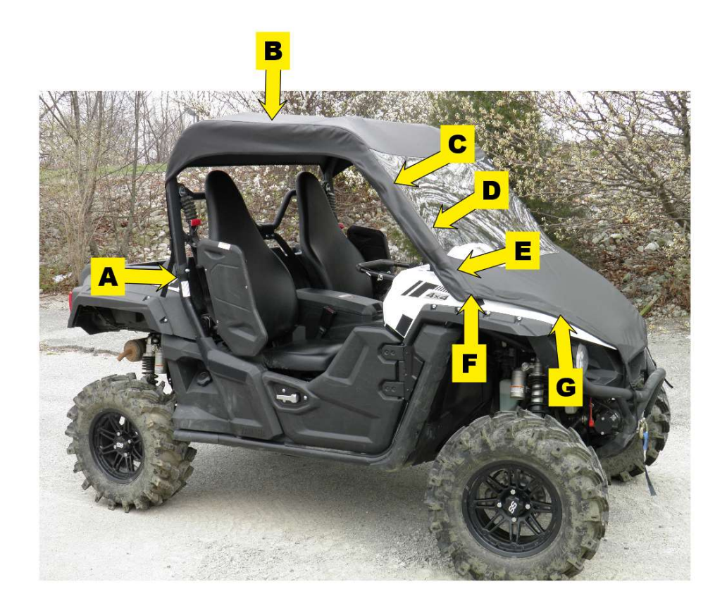
Step 4: After all adhesive hook strips are attached, begin attaching the enclosure to the cab frame. As you attach the hook and loop, square each panel to the frame. PLEASE NOTE, FOR MAXIMUM ADHESION, ALLOW THE ADHESIVE HOOK TO ADHERE TO THE FRAME FOR 24 HOURS BEFORE PULLING AGAINST THE HOOK WITH THE LOOP STRIPS.

Step 5: After installing the windshield/top, fasten the front hood straps to the vehicle bumper. Wrap the long strap under and around the front bumper. Bring the end of the strap to the buckle. Run the end of the strap through the back of the top of the buckle first. Continue running the strap through the front of the lower buckle opening. DO NOT FULLY TIGHTEN THE FRONT HOOD STRAPS UNTIL THE WINDSHIELD/TOP IS PROPERLY ALIGNED TO THE FRAME.