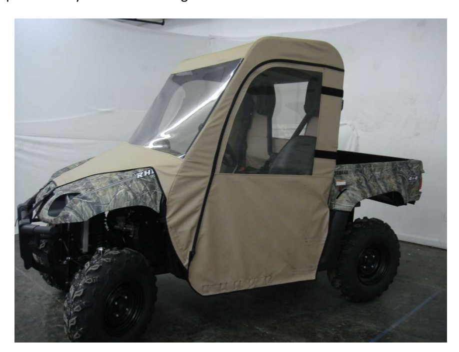
Step 10: Repeat all steps necessary to achieve a snug fit as shown below.

See enclosed Product Care sheet for instructions on how to properly care for your 3SI UTV Enclosure.