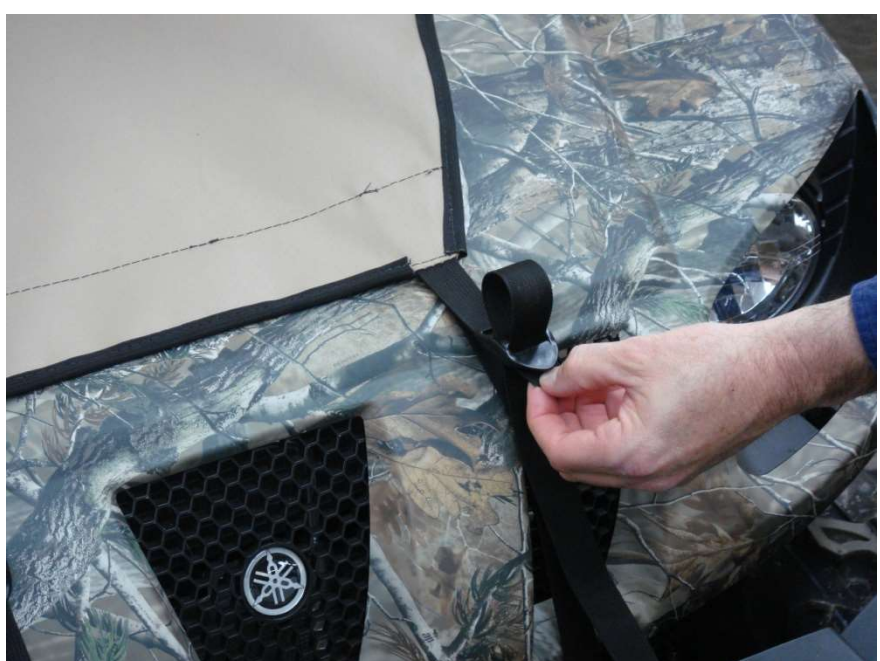
Step 7: Starting with the top Front Roll Bar Post Enclosure tabs pull outward and downward attaching tabs to 8" inch Velcro Strips on the Roll Bar as shown in figure 14.1. Repeat this process with the lower Front Roll Bar Enclosure Tabs making sure that the Windshield is centered between the Roll Bar posts.

Step 8: Tighten Front Hood Straps by pulling downward from the buckle on both straps at the same time.