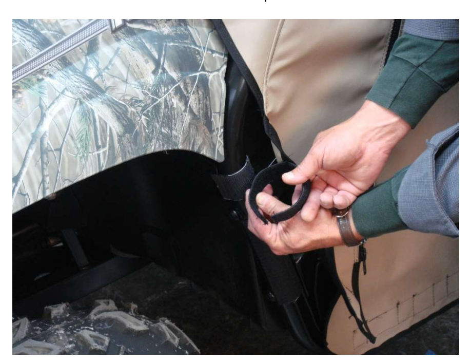
Attach front side lower Roll Bar Frame Velcro Tabs to installed 6 inch Velcro Strips by wrapping the tab around the Roll Bar Frame and Velcro Strip as shown.