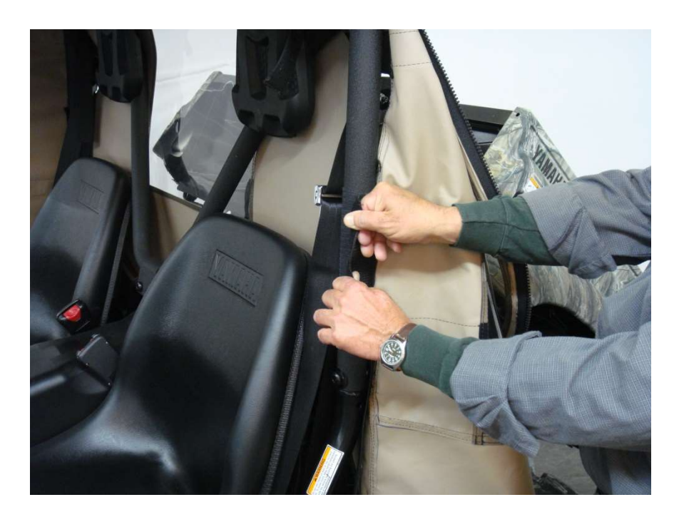
Pulling upward & outward on the 6" Rear Roll Bar Post Enclosure Velcro Tabs, attach Rear Roll Bar Post Enclosure tabs to installed 6" Velcro Strips as shown.