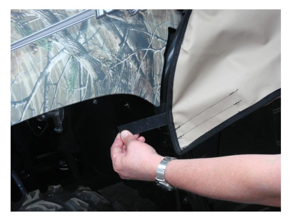
Figure 9.1 - attach Bottom Roll Bar Tabs horizontally around the Velcro Strip and Roll Bar

Step 9: attach Front Windshield Bottom Roll Bar post Velcro Tabs as shown in figure 9.1.