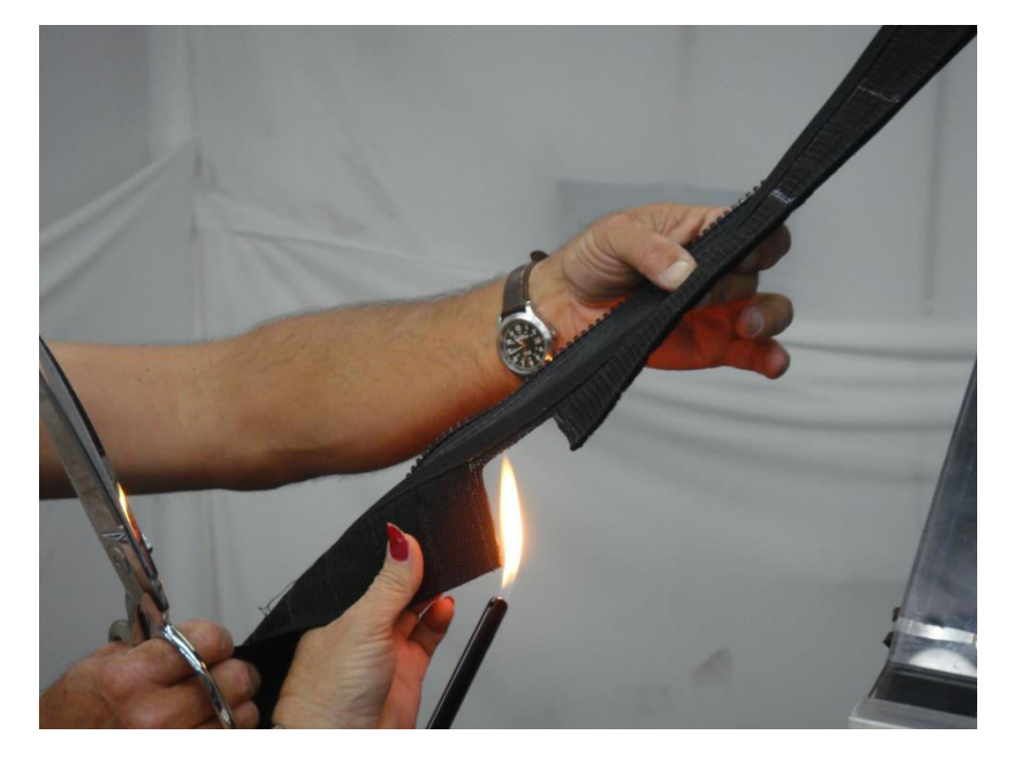
Figure 7.4 – Carefully burn the frayed thread around the cut area with a lighter.