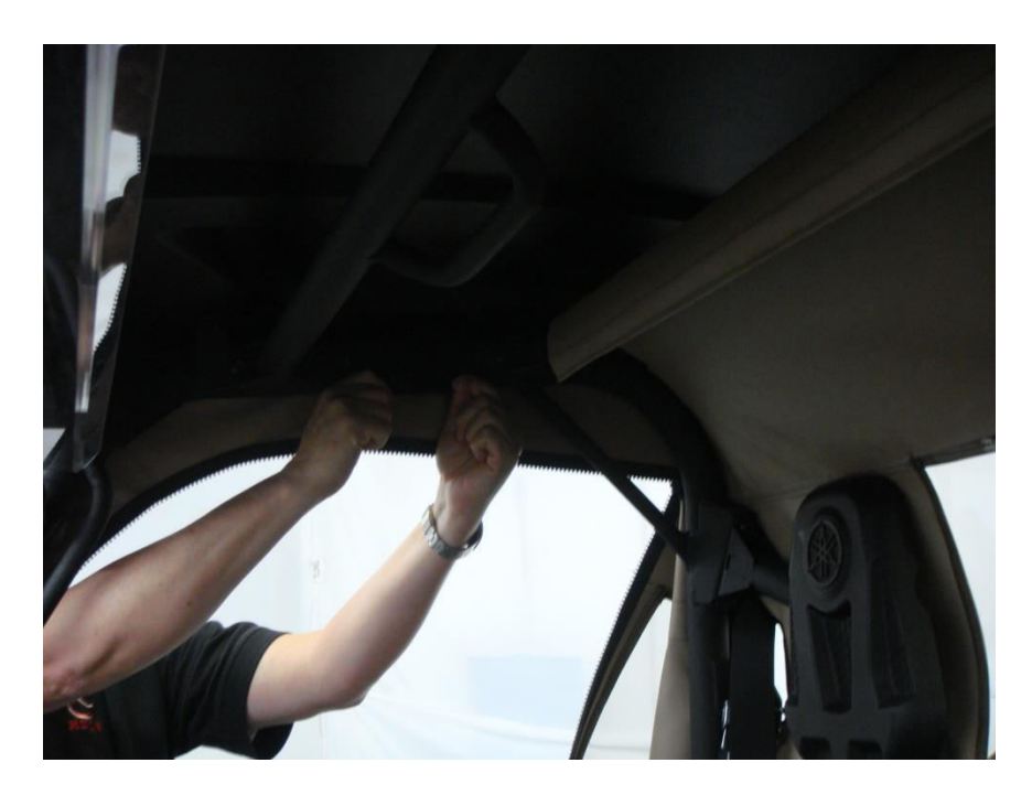
Figure 8.2 – attach 15" Side Roll Bar Cross-member Velcro Tabs