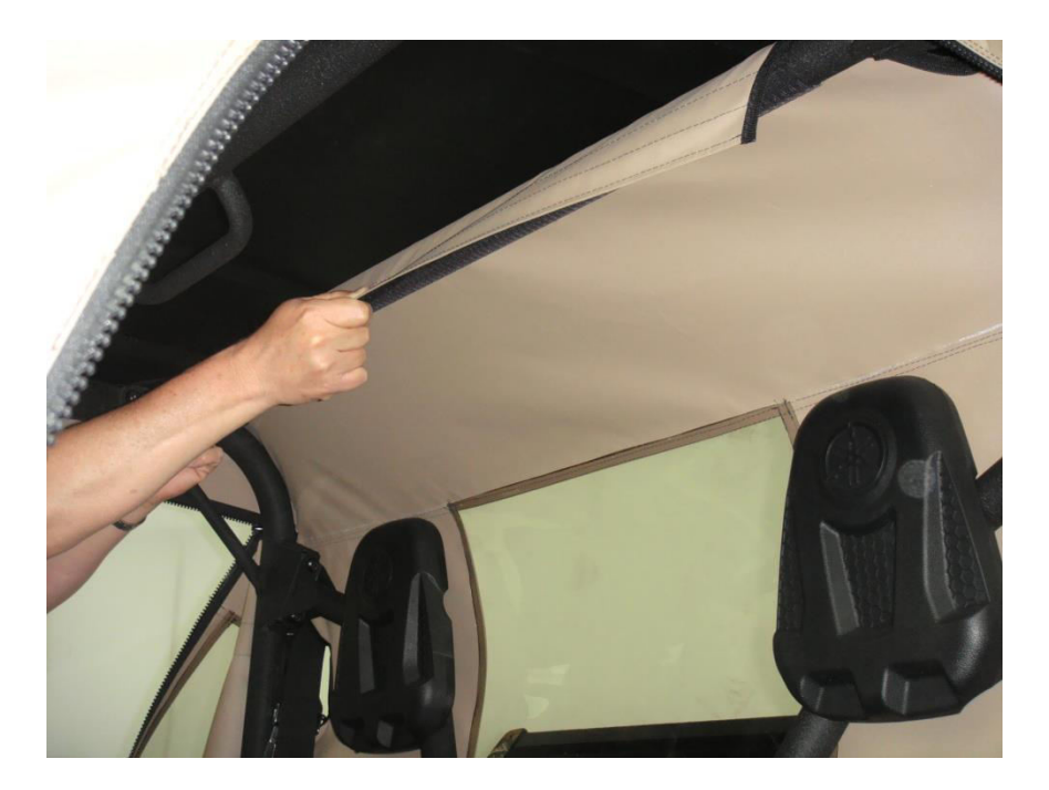
Figure 8.1 – attach 41" Rear Roll Bar Cross-member Velcro Tab

Step 8: Attach the 41" and 15" Top Roll Bar Cross-member enclosure Velcro tabs to the installed Velcro strips. Tabs will need to go over / around the Roll Bar and installed Velcro strips as shown at the top of figure 8.1 and 8.2.