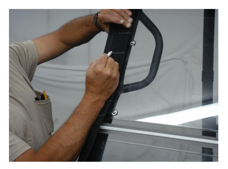
Figure 872 - Mark the Windshield Velcro Tabs for hard windshield Clamp locations