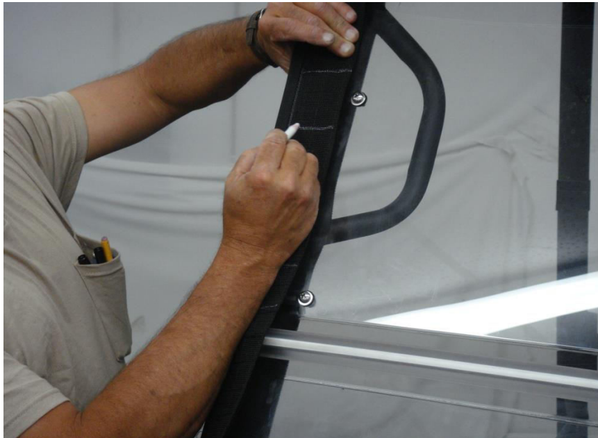
Figure 872 - Mark the Windshield Velcro Tabs for hard windshield Clamp locations