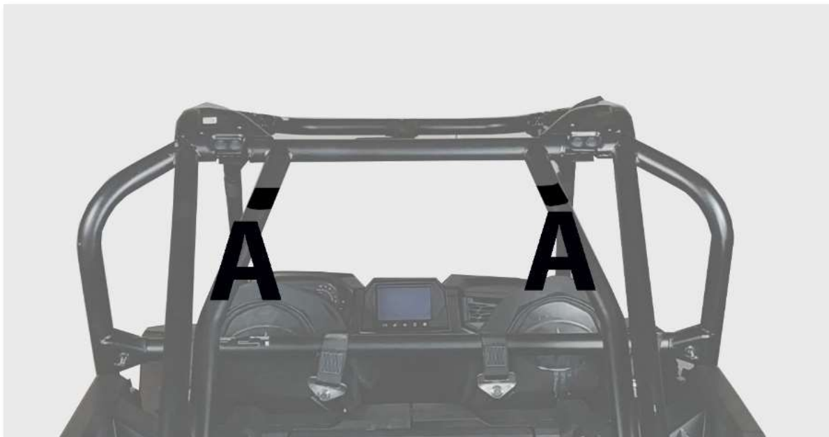
Figure 2: wrap these tabs around the roll bar.