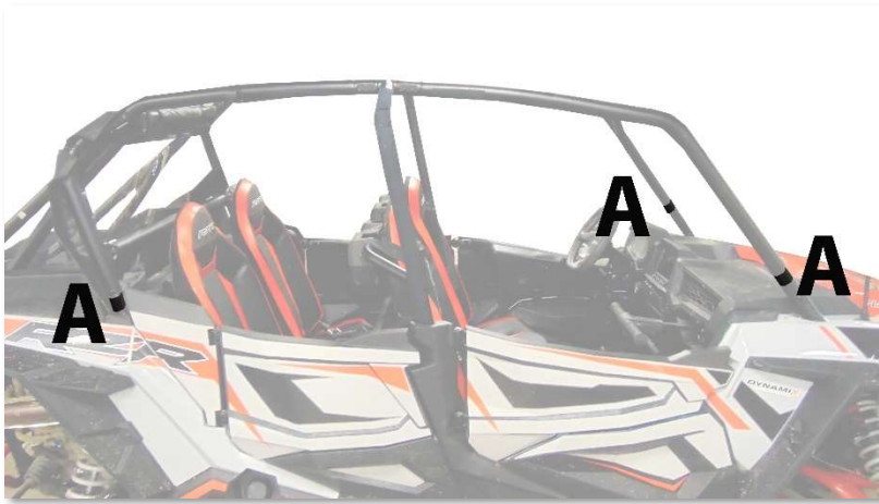
Figure 1: Shows position of Velcro strip A. Velcro will wrap around the roll bar.