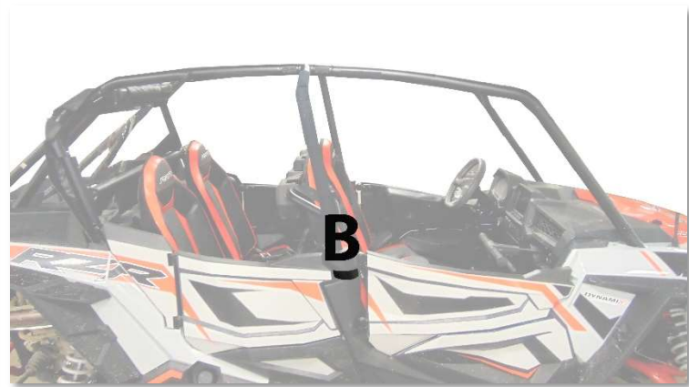
Figure 2: Velcro will wrap around the plastic below the front door hinge and notch for the latch on the back door.