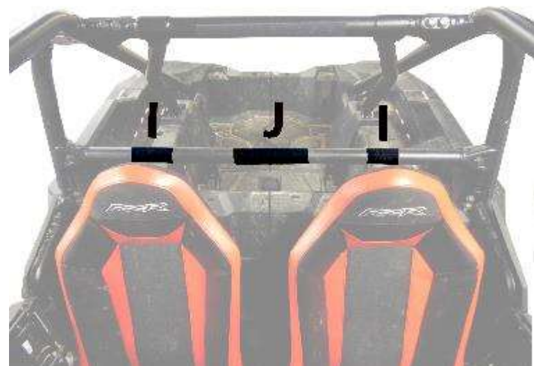
Figure 5: Shows placement of Velcro strip I AND J.