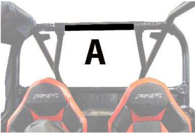
Figure 1: Shows placement of Velcro strips A.