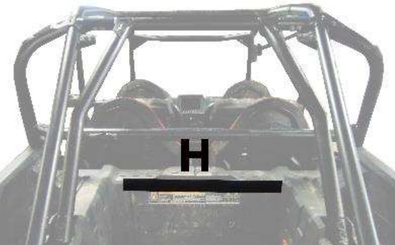
Figure 6: Shows placement of Velcro strips H.