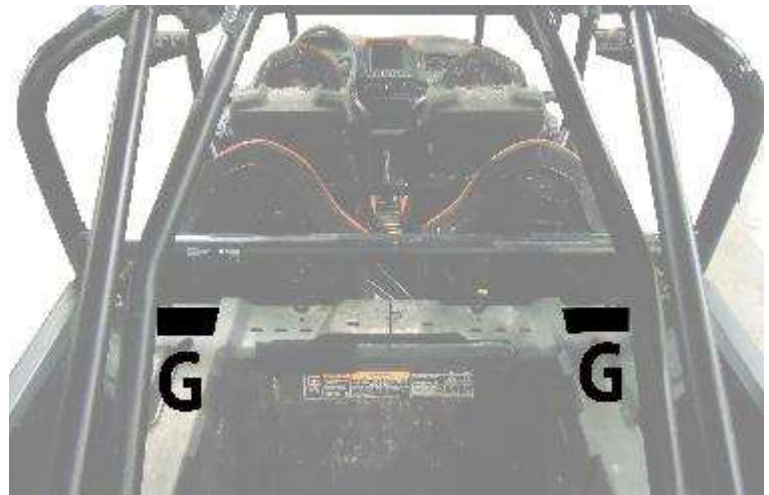
Figure 4: Shows placement of Velcro strips G.