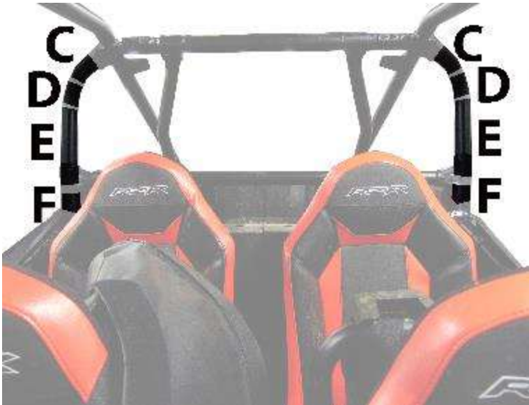
Figure 3: Shows placement of Velcro strips C-F.