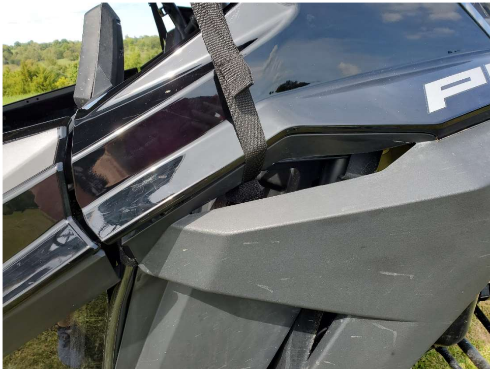
Figure 2: WRAP THE STRAP AROUND THE BAR INSIDE THE GAP BEHIND THE SEAT.