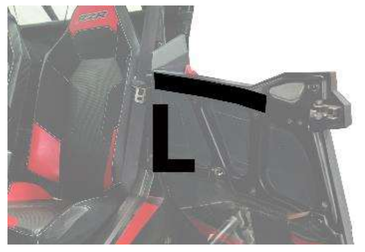
FIGURE 5: BACK DOOR INSIDE