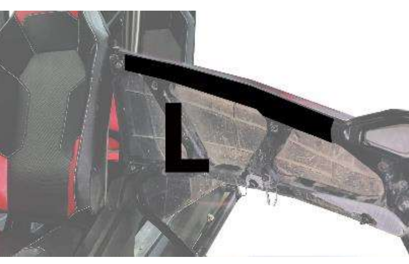
FIGURE 4: FRONT DOOR INSIDE