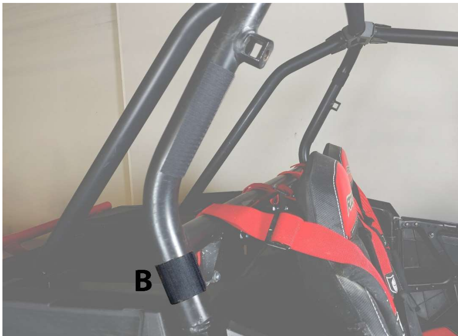
Figure 2: WRAP THESE VELCRO STRIPS AROUND THE ROLL BAR AND ATTACH DOUBLE-SIDED STRAPS. PLACE AN IDENTICAL STRIP ON THE DRIVERS SIDE.