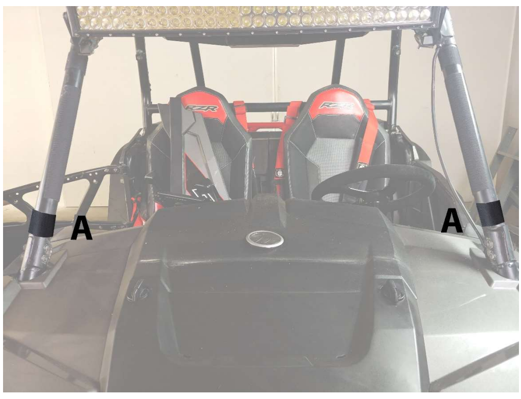
Figure 1: WRAP THESE VELCRO STRIPS AROUND THE ROLL BAR AND ATTACH DOUBLE-SIDED STRAP.