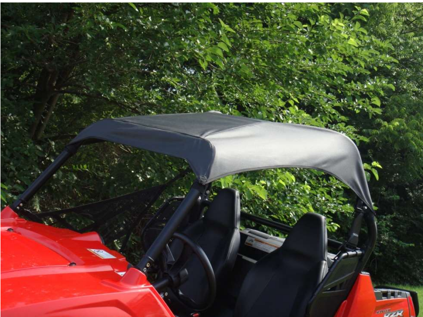
Figure 5.1 - re-tighten each Velcro Tab until the Top Cap is tight on all sides and no major wrinkles are showing.

Step 5: Repeat step 4 pulling downward firmly and re-attaching each of the Velcro Tabs until the Top Cap is tight and there are no wrinkles in the Top Cap Enclosure as shown in figure 5.1