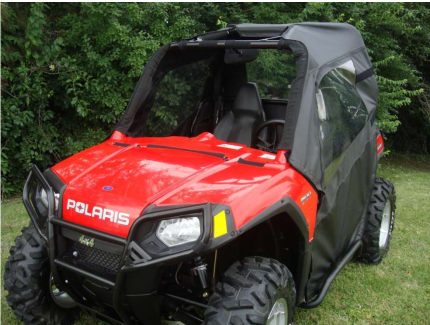
Figure 10 .1 – Repeat Steps 6, 7, 8, and 9 to fully tighten the enclosure on the Cab

Step 10: Repeat Steps 6, 7, 8 and 9 as necessary until the Enclosure fits snugly to the Vehicle Roll Bar structure as shown in figure 10.1