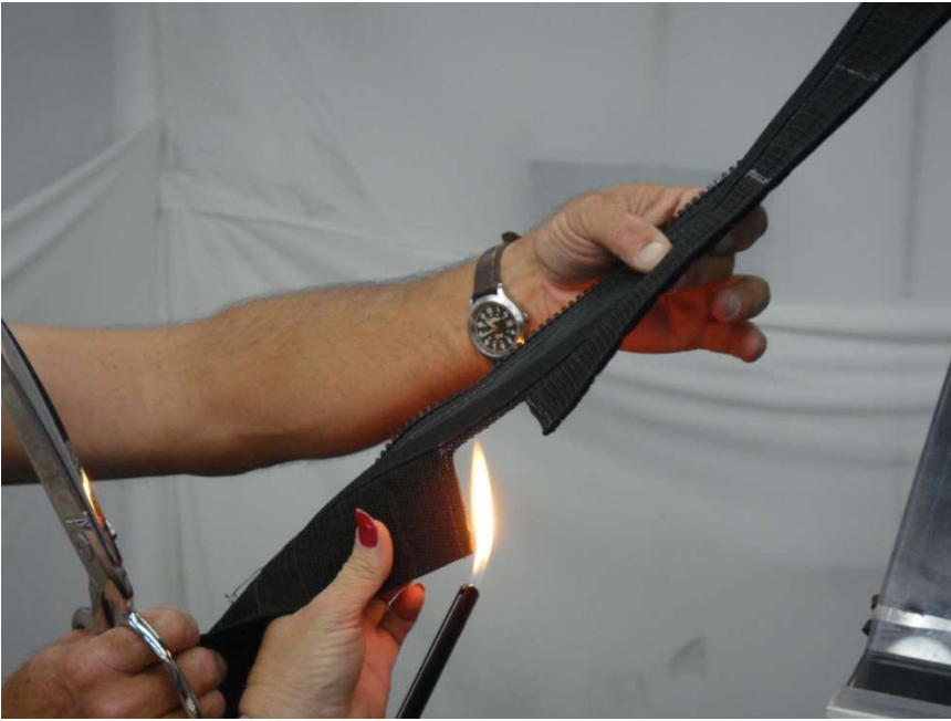
Figure 7.3 – Carefully burn the frayed thread around the cut area with a lighter.

Step 8: Attach the 11", 8" and 6" Top Roll Bar enclosure Velcro tabs to the installed Velcro strips. Tabs will need to go over / around the Roll Bar and installed Velcro strips as shown at the top of figure 8.1.