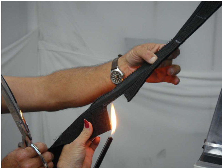
Figure 7.4 – Carefully burn the frayed thread around the cut area with a lighter.