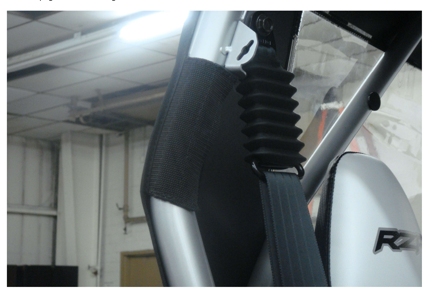
Figure 6.1 attach 5" Velcro strips vertically on the Rear Roll Bar uprights