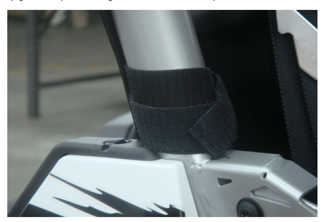
Figure 7.1 - install 6" Velcro Strips horizontally around Center Roll Bar uprights in locations indicated below

Velcro Adhesive Hook Strips-2" Wide x 6" Long