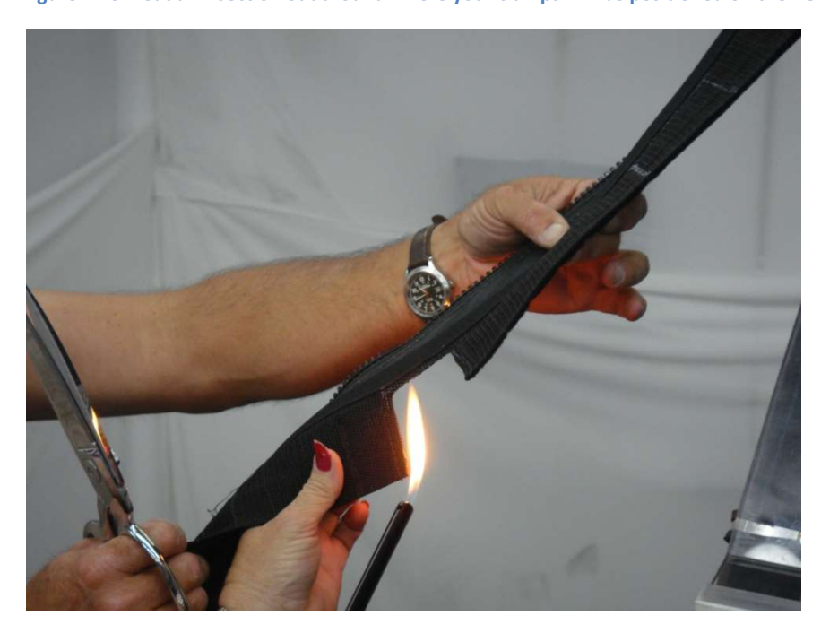
Figure 17.4 – Carefully burn the frayed thread around the cut area with a lighter.

Step 18: Attach each of the sewn-in Velcro loop strips to the adhesive strips. Repeat any and all steps necessary to square and tighten the enclosure to the cab frame as shown below.