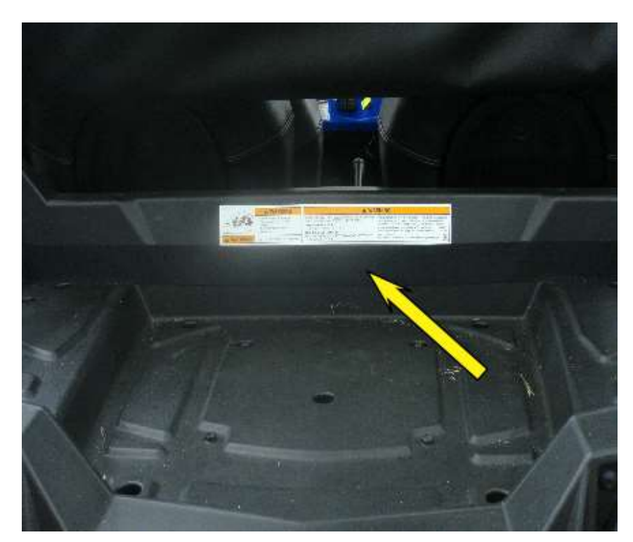
Figure 5.1 - attach 40" Velcro strips to Rear Cab Frame facing toward the rear of the vehicle

Step 5: Remove the clear plastic backing from the (A) 40" Velcro strip and install along the bottom of the Rear Cab Frame as shown in figure 5.1