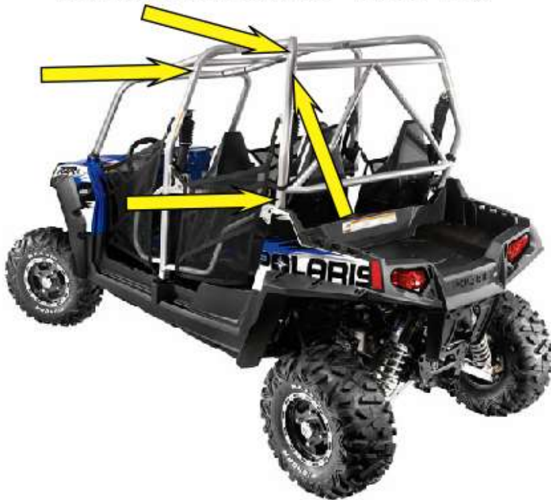
Figure 7.2 - install 6" Velcro Strips horizontally around Roll Bar uprights in locations indicated

Velcro Adhesive Hook Strips-2" Wide x 6" Long