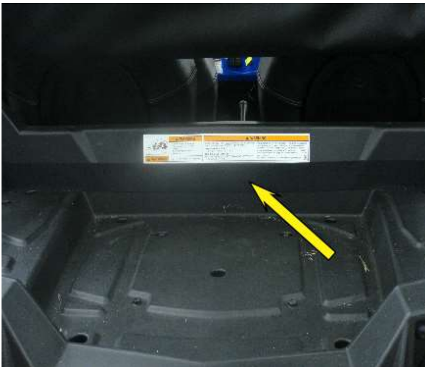
Figure 5.1 - attach 40" Velcro strips to Rear Cab Frame facing toward the rear of the vehicle

Step 5: Remove the clear plastic backing from the (A) 40" Velcro strip and install along the bottom of the Rear Cab Frame as shown in figure 5.1