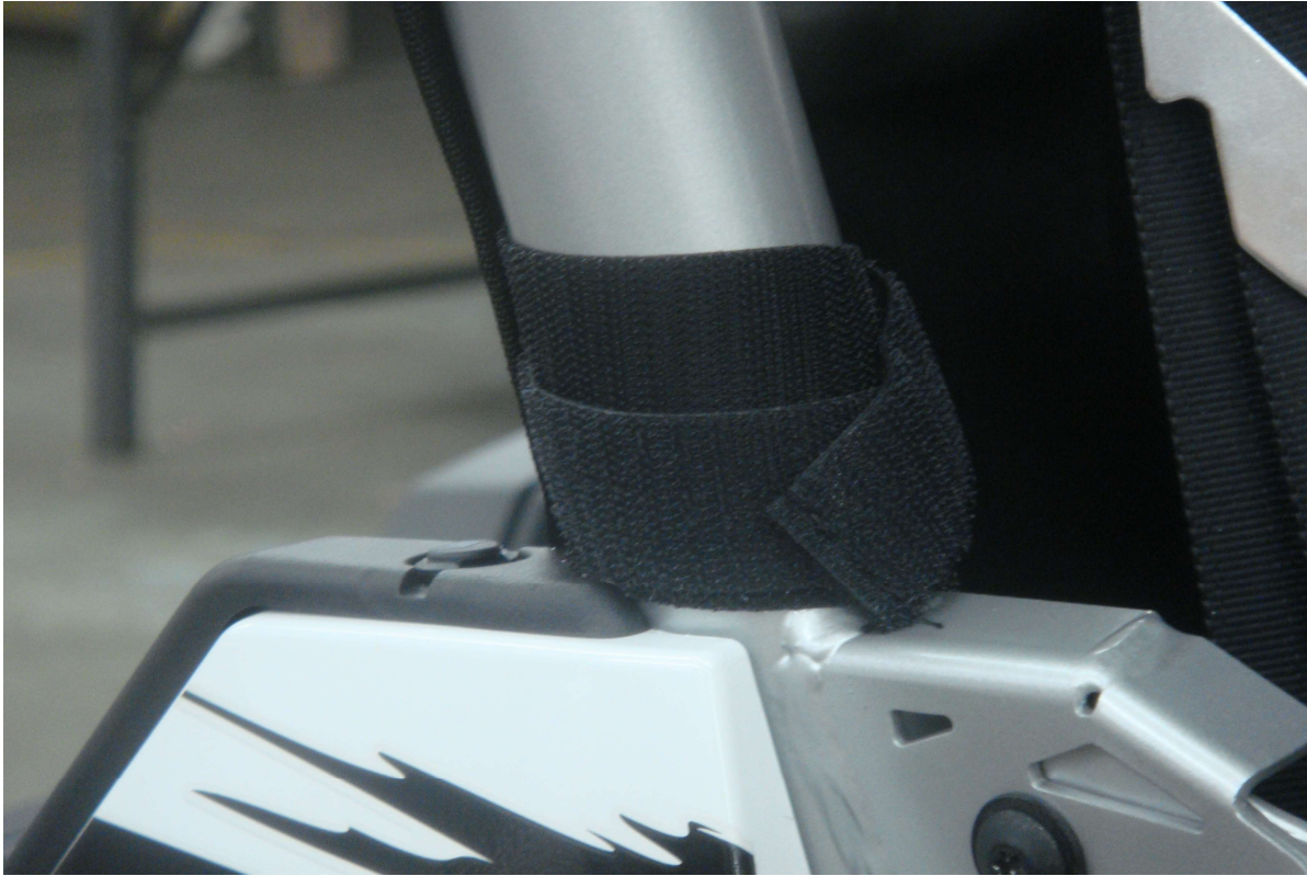
Figure 7.1 - install 6" Velcro Strips horizontally around Center Roll Bar uprights in locations indicated below

Step 7: Remove the clear plastic backing from the 6" Velcro strips and install horizontally around the Center Roll Bar Uprights at the top as shown in figure 7.1 and 7.2. Note Velcro Strip seams should face the center of the cab.