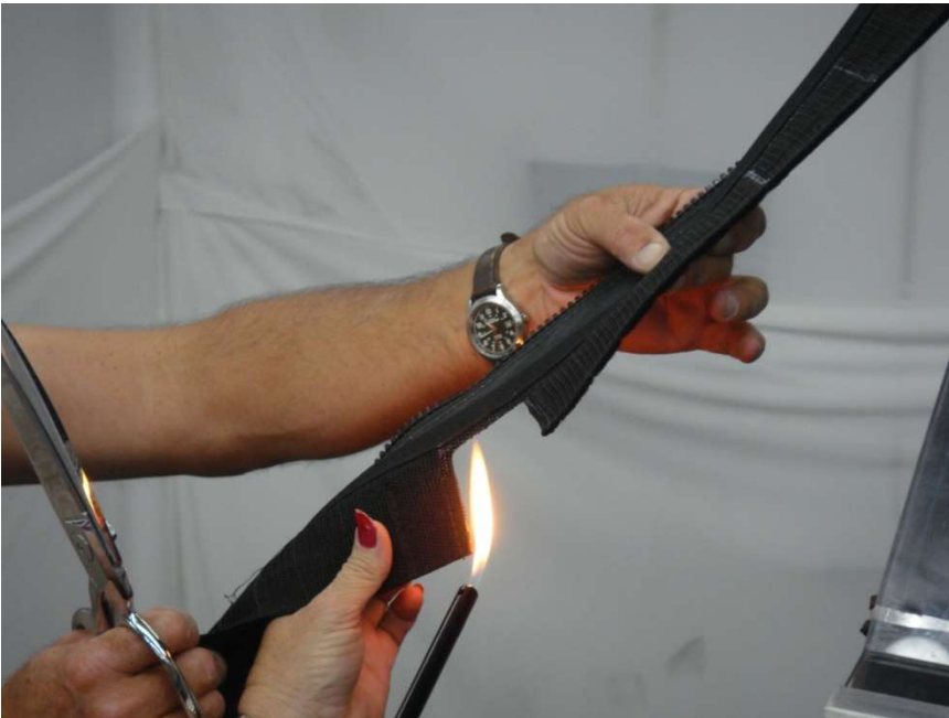
Figure 17.4 – Carefully burn the frayed thread around the cut area with a lighter.

Step 18: Attach each of the sewn-in Velcro loop strips to the adhesive strips. Repeat any and all steps necessary to square and tighten the enclosure to the cab frame as shown below.