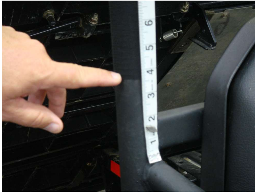
Figure 4.2 – Adhere strips Approx 4" above the Arm Rest bar