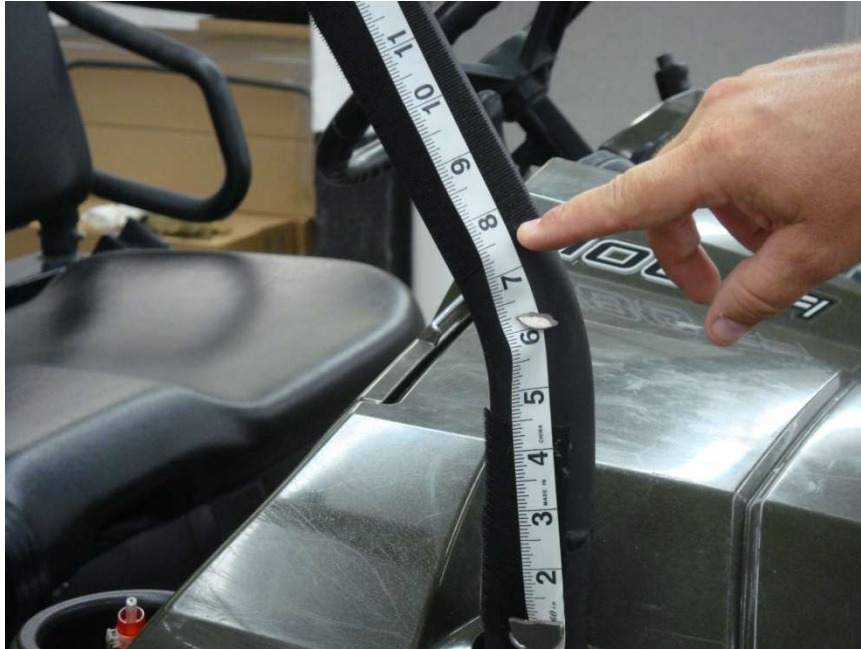
Figure 4.4 – Adhere strips approx 8" above where the Roll Bar uprights go through the Cowl