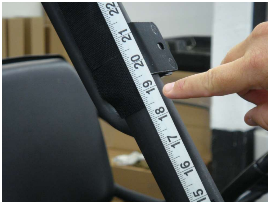
Figure 4.3 – adhere strips approx 19" above where the Roll Bar upright go through the Cowl