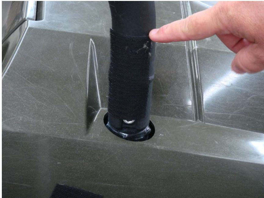
Figure 4.5 – adhere strips at the bottom of the Roll Bar Post uprights