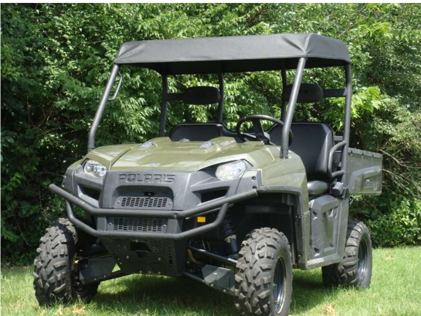
Figure 6.1 - re-tighten each Velcro Tab until the Top Cap is tight on all sides and no major wrinkles are showing.

Step 6: Repeat step 4 pulling downward firmly and re-attaching each of the Velcro Tabs until the Top Cap is tight and there are no wrinkles in the Top Cap Enclosure as shown in figure 5.1