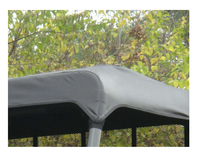
Figure 4.1 - Wrap 6" adhesive hook strips around roll bar. Wrap the double-sided straps at each corner around the adhesive strips.

Step 5: Pull the Enclosure down tightly keeping Enclosure seams aligned with the center of each Roll Bar and attach each Enclosure Velcro Tab to its respective installed 6" Velcro Strip as shown in figure 4.1.