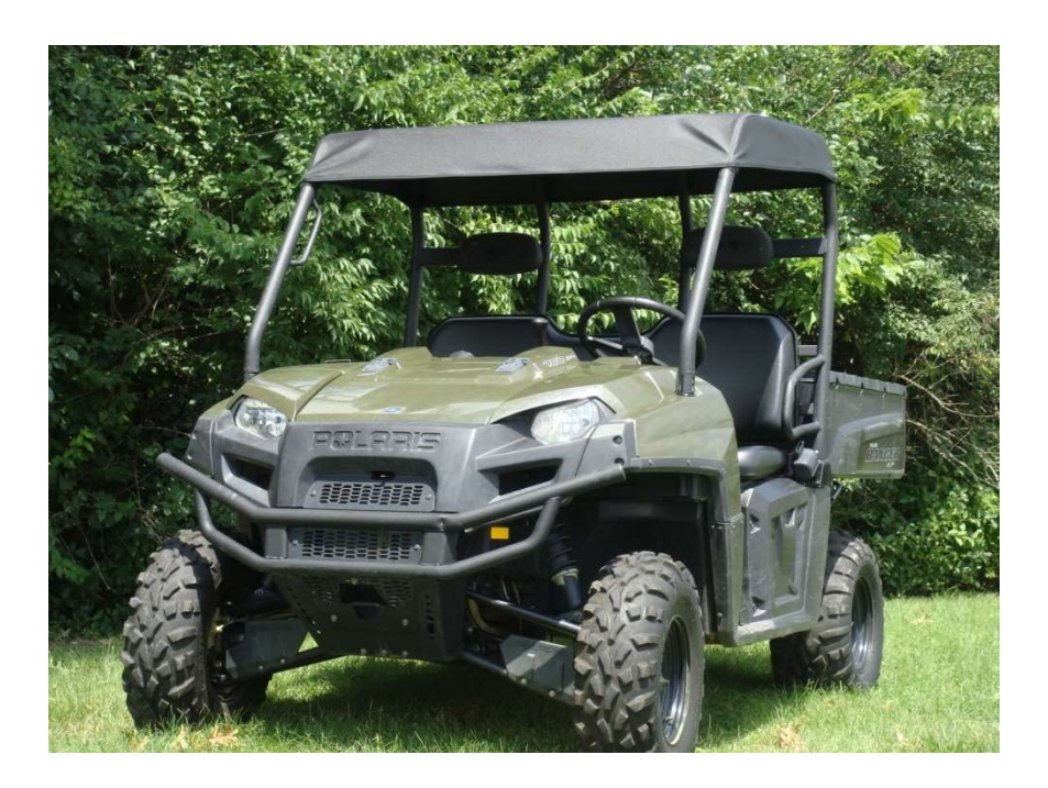
Figure 6.1 - re-tighten each Velcro Tab until the Top Cap is tight on all sides and no major wrinkles are showing.

See enclosed Product Care sheet for instructions on how to properly care for your 3SI UTV Enclosure.