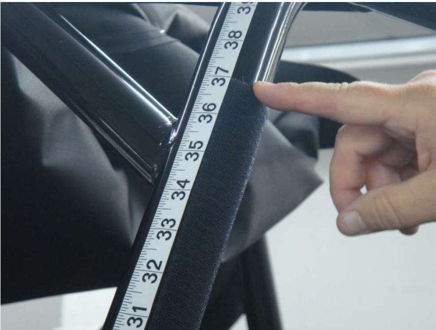
Figure 3.3 - attach 10" Velcro Strips vertically 37" above the front roll bar post cowl opening