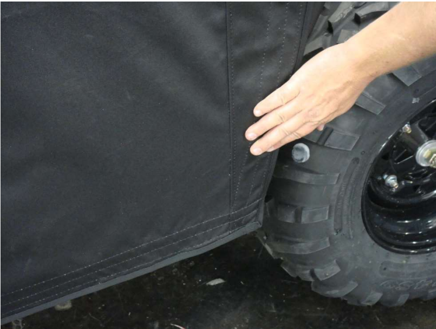
Figure 12.1 – attach Door Rear Panel Enclosure 20" Velcro Tabs

Step 12: Zip Doors closed and attach Door Rear Panel, Door Rocker Panel and Door Front Cowl Panel Velcro Tabs to respective Velcro Strips as shown in figure 12.1 , 12.2 and 12.3.