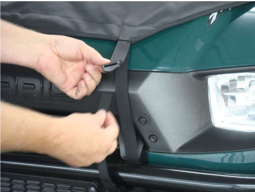
Figure 9.1 - run front hood straps around front bumper

Step 9: Fasten pre-attached Enclosure Front Hood Straps to the Vehicle front bumper as shown in figure 9.1. Bringing the end of the straps up to the latch buckle, run the end through the back of the top buckle opening first and then through the front of the lower buckle opening as shown in figure 9.2. DO NOT FULLY TIGHTEN FRONT HOOD STRAPS AT THIS TIME.