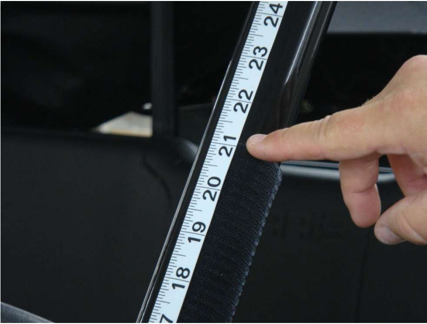
Figure 3.2 - attach 10" Velcro strips vertically 21" above the front roll bar post cowl opening