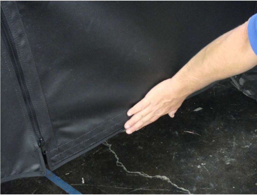
Figure 12.2 – attach Door Rocker Panel Enclosure 27" Velcro Tabs