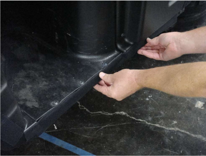
Figure 6.1 – attach 27” Velcro Strips horizontally along the door Rocker Panel – align the top side and fold the bottom 1” underneath the Rocker Panel

Step 6: Remove the clear plastic backing from the 27” Velcro strips and attach horizontally along the Rocker Panel as shown in figure 6.1. Note: the top edge of the Velcro strip should be aligned along the top edge of the Rocker Panel and the bottom 1” width should be folded underneath the Rocker Panel.