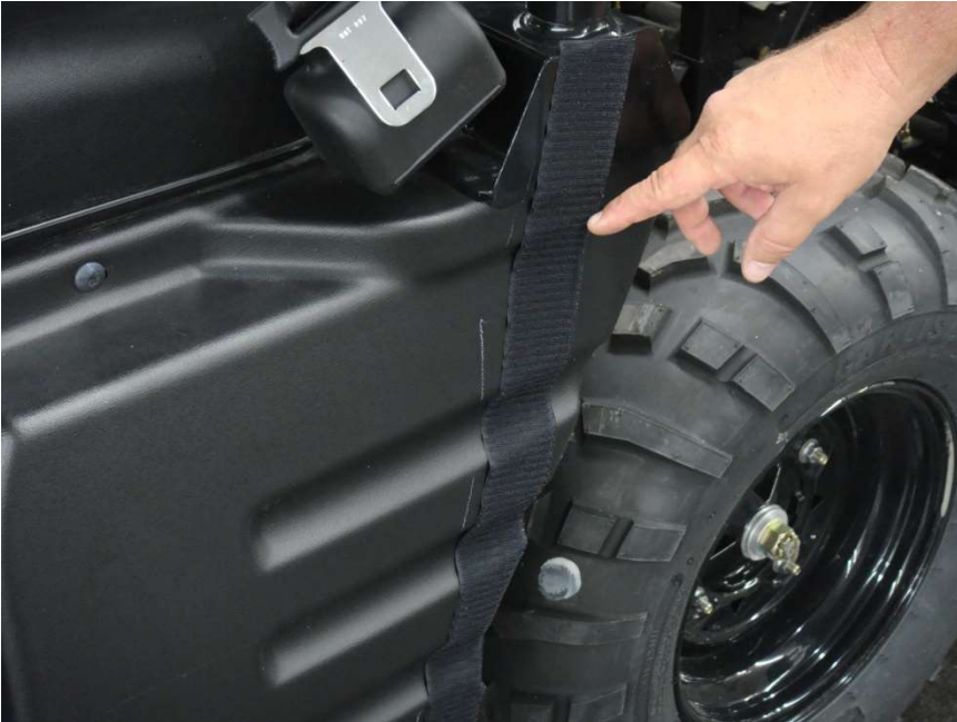
Figure 4.1 - attach 20" Velcro Strips vertically along the lower Rear Door Panel

Step 4: Remove the clear plastic backing from the 20" Velcro strips and attach vertically to the Rear Door Panel as shown in figure 4.1