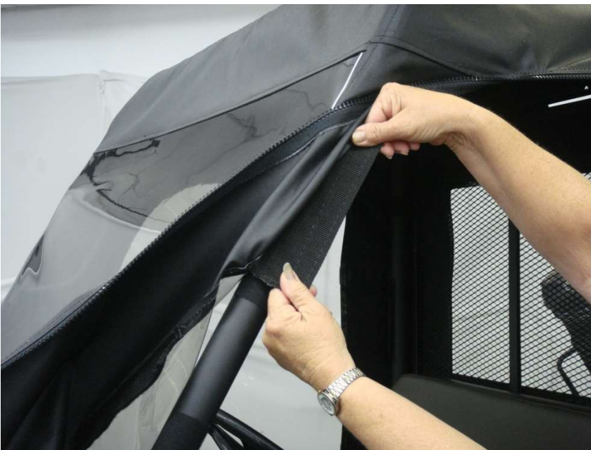
Figure 10.1 - attach top front Windshield roll bar 8" Velcro tabs

Step 10: Starting with the top Front Roll Bar Post Enclosure tabs pull outward and downward attaching tabs to the top 8" inch Velcro Strips as shown in figure 10.1. Repeat this process with the middle and then lower Front Roll Bar Enclosure Tabs as shown in figure 10.2 and 10.3 making sure that the Windshield is centered between the Roll Bar posts. Note: this step is best performed with an assistant attaching Tabs on both sides of the Windshield at the same time.