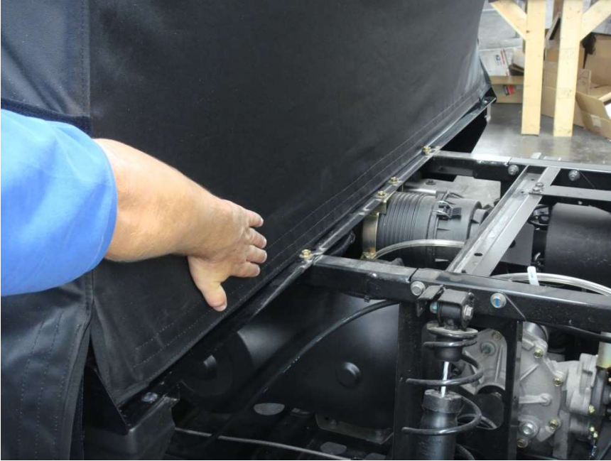
Figure 8.1 - square rear of enclosure to cab and attach rear enclosure Velcro tab to installed Velcro strip

Step 8: Begin attaching Enclosure by first squaring the back of the Enclosure to the Rear of the Cab frame and attaching the lower Rear Cab Velcro tab to the installed 55" Velcro strip as shown in figure 8.1