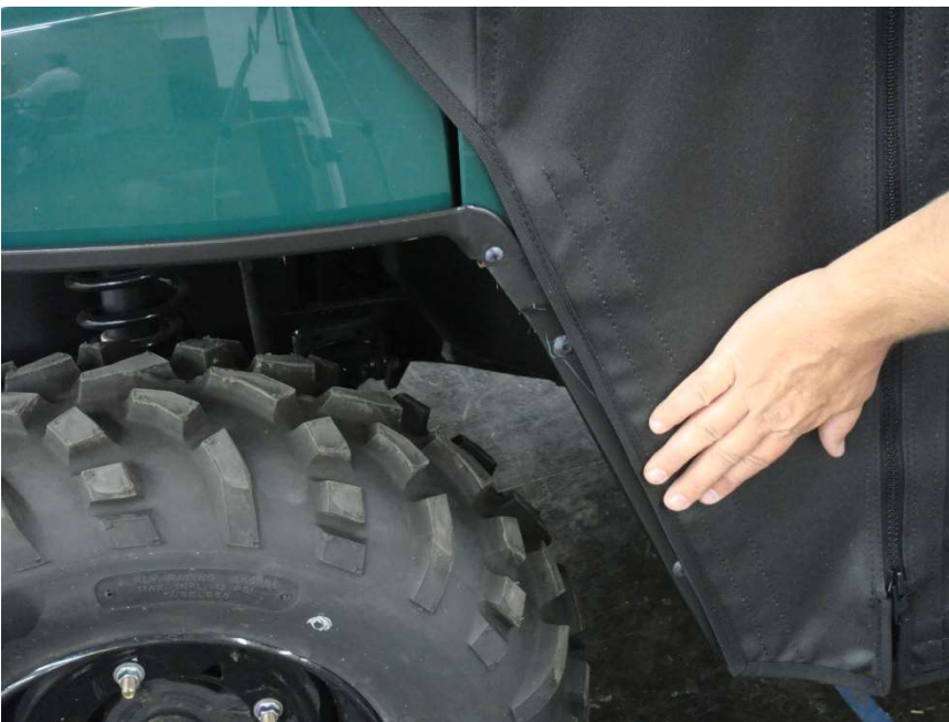
Figure 12.3 – attach Door Front Cowl Panel Enclosure 18 ½" Velcro Tabs