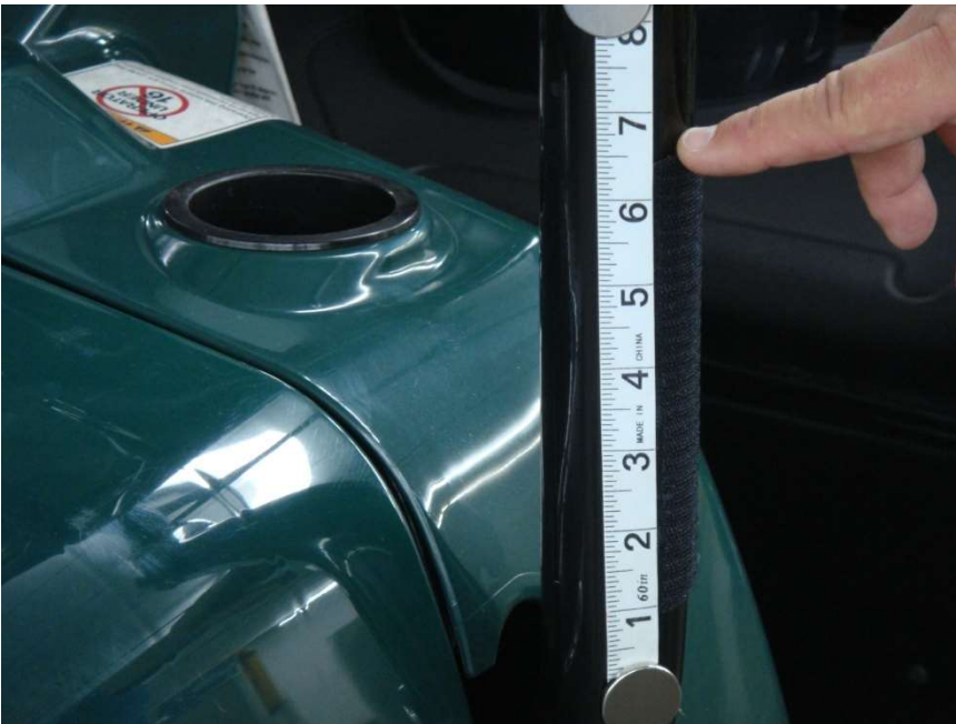
Figure 3.1 - attach 5" Velcro strips vertically 6 ½" above the front roll bar post cowl opening

Step 3: Remove the clear plastic backing from the 5" and 10" Velcro strips and adhere vertically along the Front Windshield Roll Bar Posts as shown in figures 3.1, 3.2 and 3.3. Velcro strips should face away from the center of the cab. Also adhere 10" Velcro Strips vertically along the middle of the rear Roll Bar post uprights