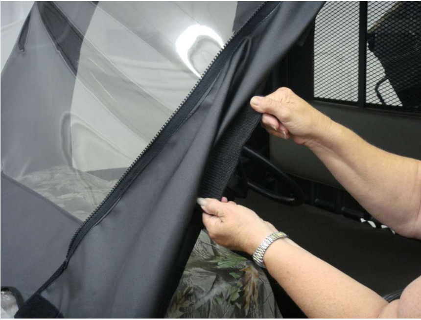
Figure 10.2 - attach center front Windshield roll bar 8" Velcro tabs