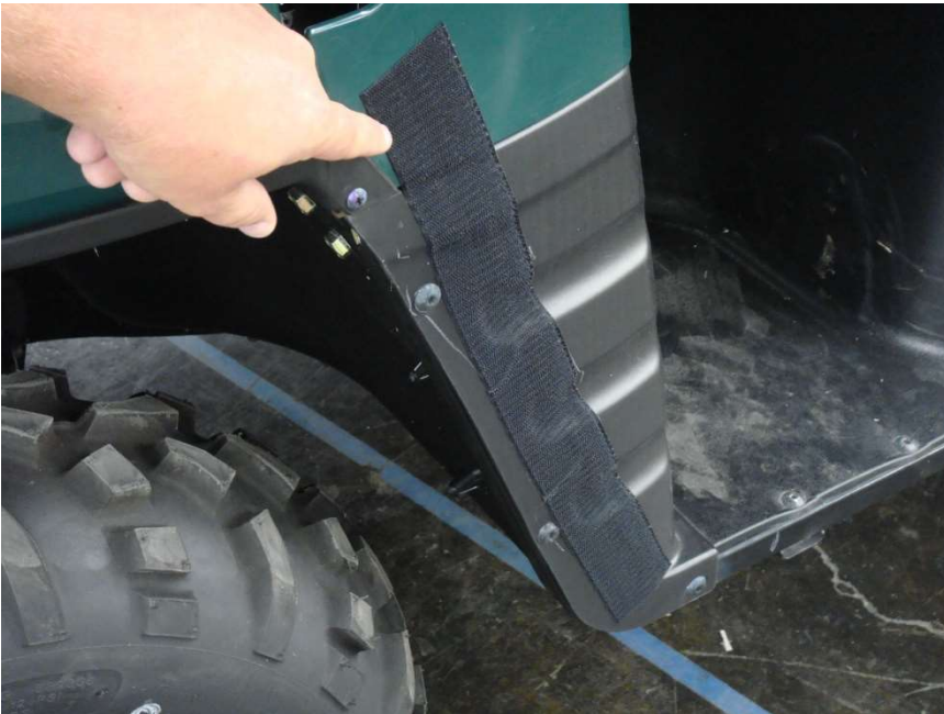
Figure 5.1 – attach 18 1/2" Velcro Strips vertically along the lower Front Cowl Panel

Step 5: Remove the clear plastic backing from the 18 1/2" Velcro strips and attach vertically to the Front Cowl Panel as shown in figure 5.1