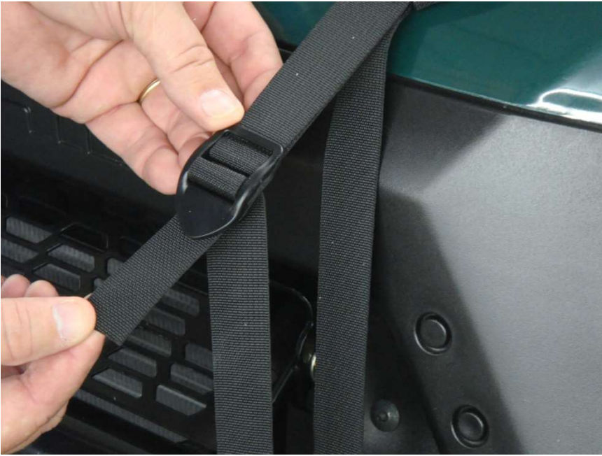
Figure 9.2 - thread front hood straps through the buckles

Step 10: Starting with the top Front Roll Bar Post Enclosure tabs pull outward and downward attaching tabs to the top 8" inch Velcro Strips as shown in figure 10.1. Repeat this process with the middle and then lower Front Roll Bar Enclosure Tabs as shown in figure 10.2 and 10.3 making sure that the Windshield is centered between the Roll Bar posts. Note: this step is best performed with an assistant attaching Tabs on both sides of the Windshield at the same time.