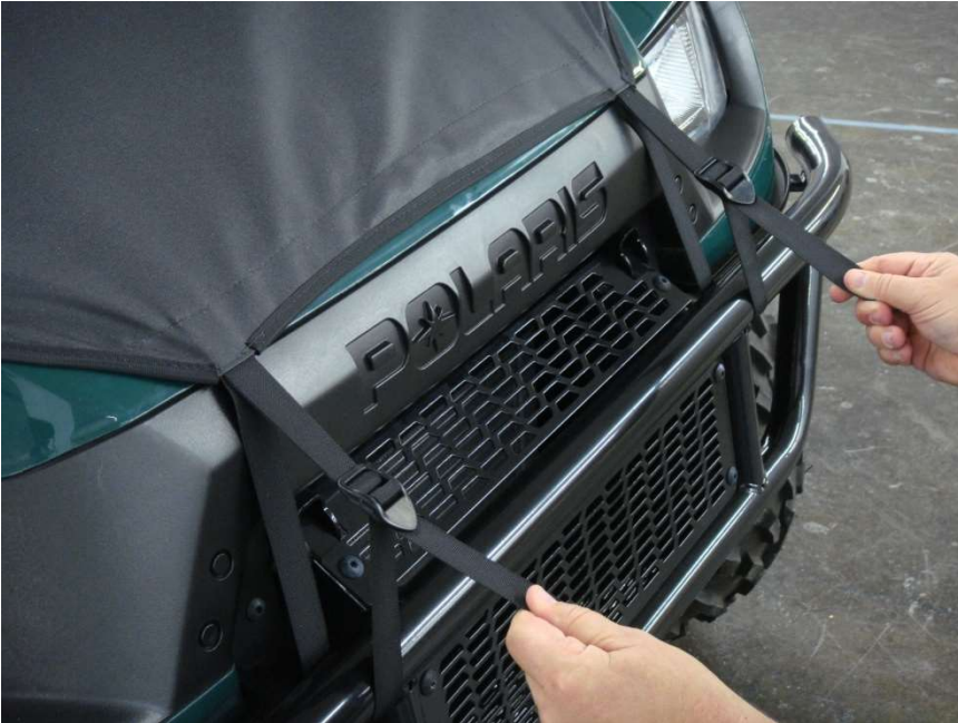
Figure 11.1 – Fully tighten both Hood Straps pulling downward on both at the same time

Step 11: Tighten Front Hood Straps by pulling downward from the buckle on both strap ends at the same time as shown in figure 11.1