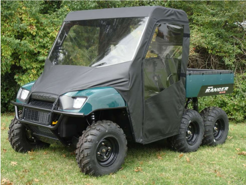
Figure 13.1 – Repeat Steps 10, 11 and 12 until the enclosure fits snugly to the vehicle roll bar cab and windows are tight

Step 13: Repeat Steps 10, 11 and 12 until the Enclosure fits snugly to the Vehicle Roll Bar structure and front and rear windows are tight as shown in figure 13.1