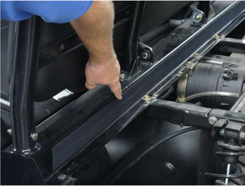
Figure 2.1 – attach 55" Velcro strip to the Rear Cab Frame

Step 3: Remove the clear plastic backing from the 5" and 10" Velcro strips and adhere vertically along the Front Windshield Roll Bar Posts as shown in figures 3.1, 3.2 and 3.3. Velcro strips should face away from the center of the cab. Also adhere 10" Velcro Strips vertically along the middle of the rear Roll Bar post uprights