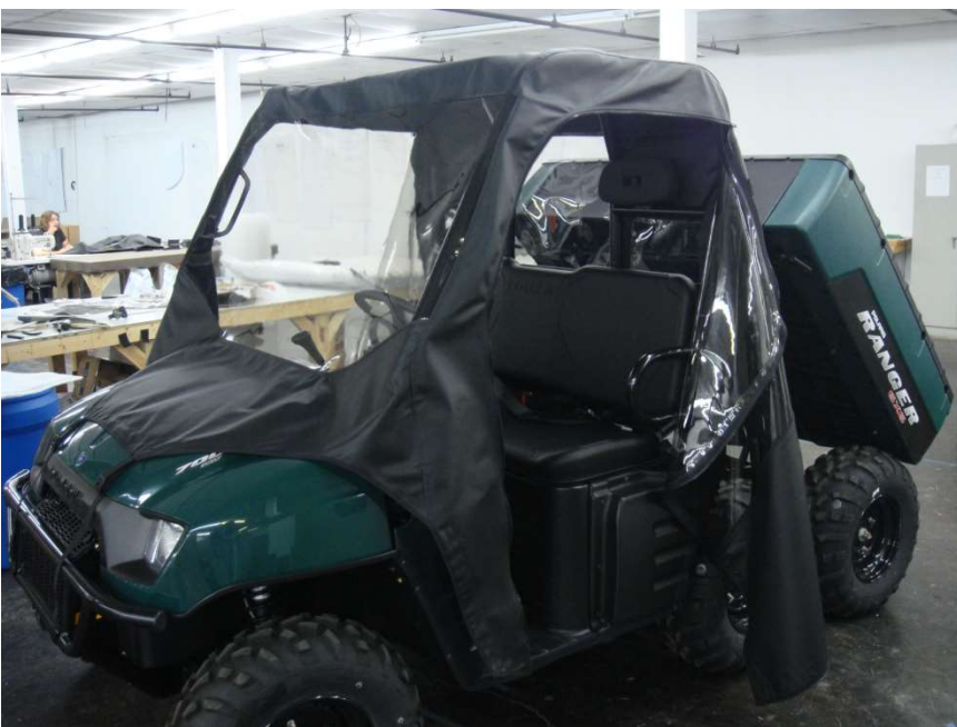
Figure 7.1 - place enclosure on vehicle cab roll bar structure – align enclosure seams with center of roll bars

Step 7: Place the Full Cab Enclosure on top of the Roll Bar Cab Frame as shown in figure 7.1 and adjust so that the enclosure seams are located near the center of the Roll Bars. The vehicle bed will need to be raised for this installation step.