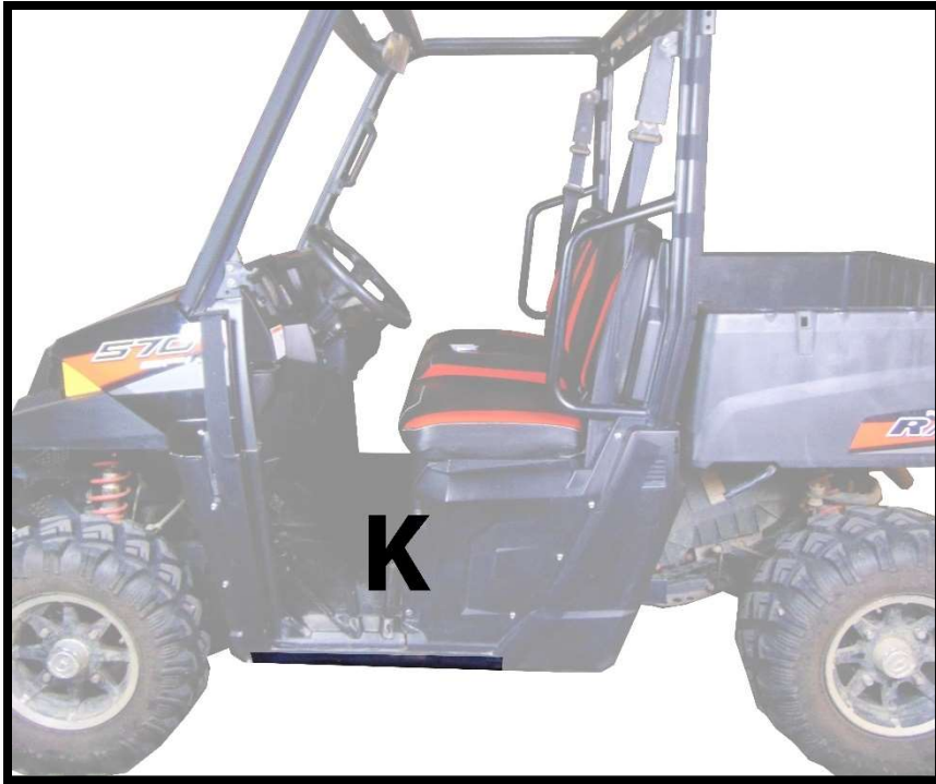
Figure 9: SHOWS PLACEMENT OF 22" VLECRO STRIPS (K)