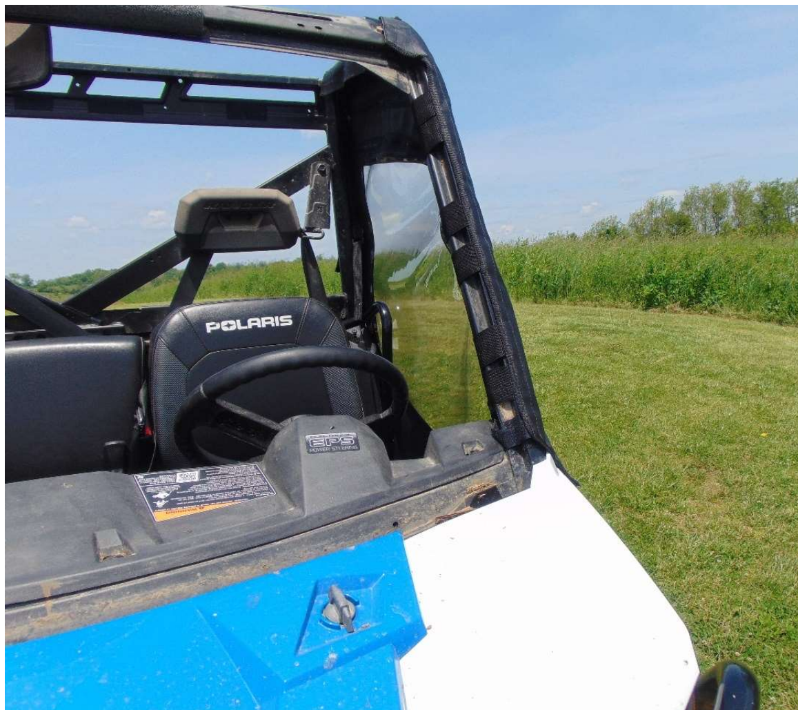
Figure 10: WHEN ATTACHING DOOR TO ADHESIVE VELCRO START WITH SIDE A. ALIGN BLACK TRIM ON THE DOOR PANEL TO THE EDGE OF THE INSET ROLL BAR. WRAP TABS AROUND THE INSIDE OF THE BAR AND ATTACH TO ADHESIVE VELCRO. CONTINUE TO ATTACH DOOR TABS AND STRAPS IN THE ORDER OF THE PICTURES AND VELCRO CHART.