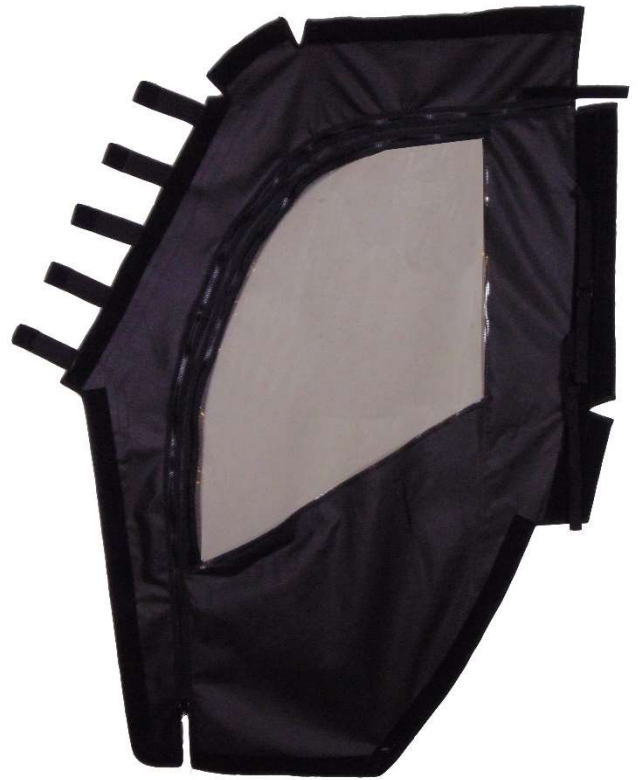
PASSENGER SIDE (INSIDE)