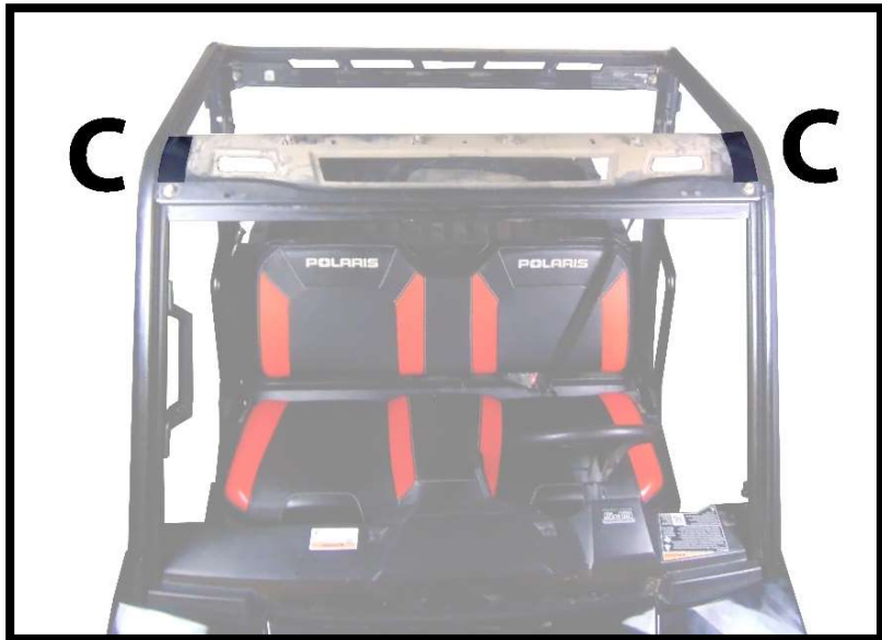
Figure 3: SHOWS PLACEMENT OF 7" VELCRO STRIP (C)