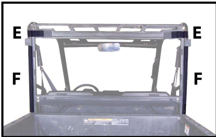
Figure 5: SHOWS PLACEMENT OF 10" AND 22" VELCRO STRIPS (E AND F)