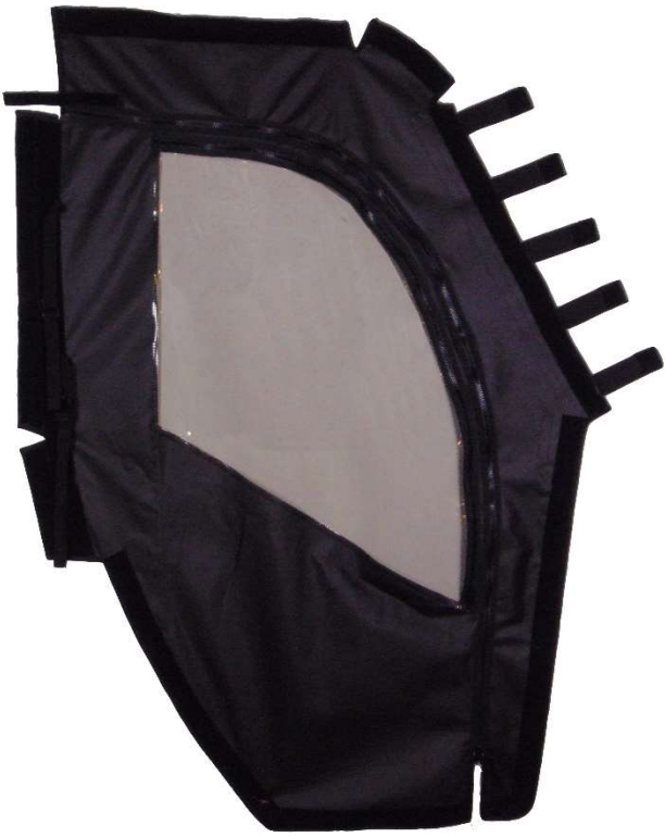
DRIVERS SIDE (INSIDE)