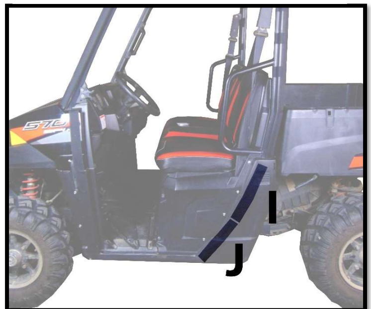
Figure 8: SHOWS PLACEMENT OF 13" VELCRO STRIPS (I AND J).