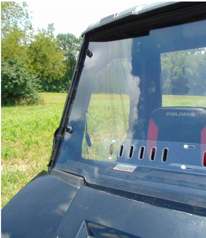
Figure 12: REINSTALL WINDSHIELD AND HARD TOP OVER THE DOOR KITS TABS AND STRAPS.