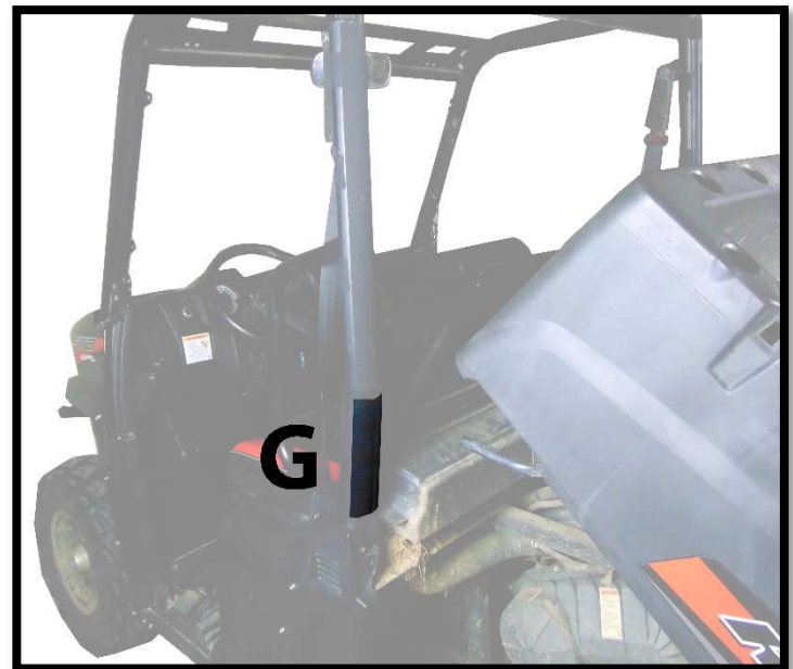
Figure 6: SHOWS PLACEMENT OF 9" VELCRO STRIPS (G)