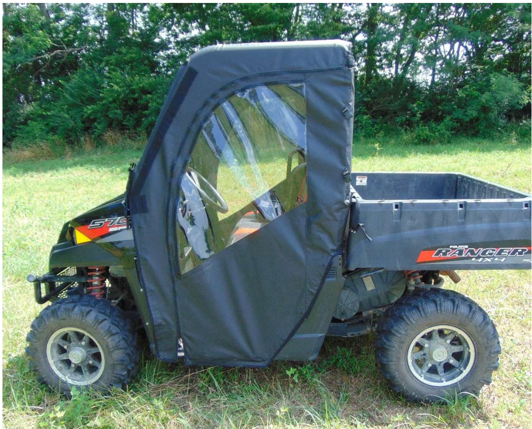
Figure 11: DOOR SHOULD RESEMBLE PHOTO WHEN INSTALLATION IS COMPLETE.