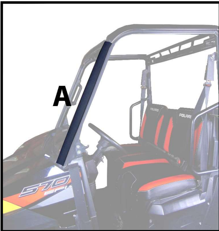
Figure 1: SHOWS PLACEMENT OF 26" VELCRO STRIPS (A) VELCRO. THE STRIP OF VELCRO SEWN ON TO THE DOOR WILL ATTACH TO THIS STRIP.