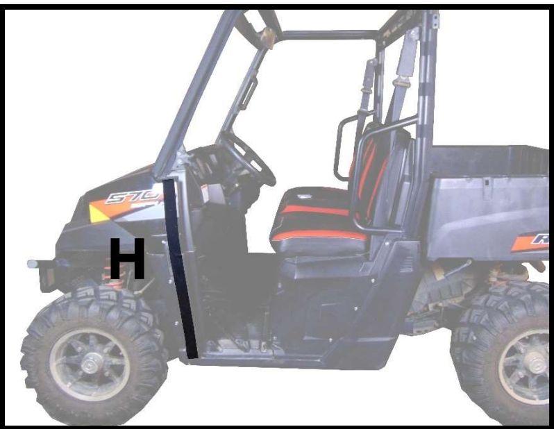
Figure 7: SHOWS PLACEMENT OF 32" VELCRO STRIPS (H)