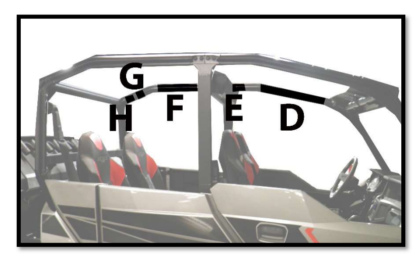
Figure 2: these strip should be place facing the inside of the UTV