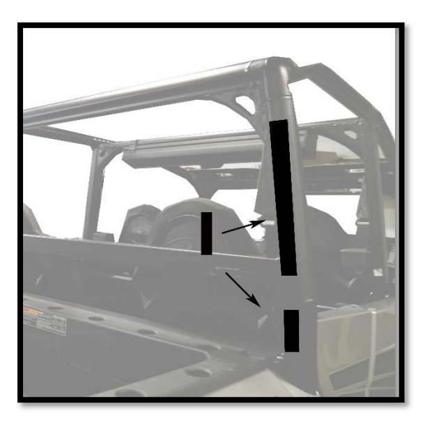
Figure 3: this strip will be one strip you may choose to cut the strip or place the strip all the way down the back. Either way will work.