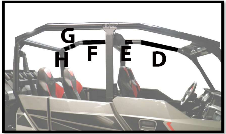
Figure 2: these strip should be place facing the inside of the UTV