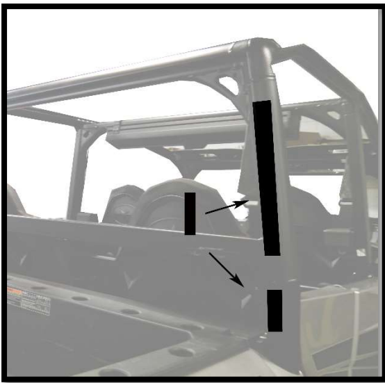
Figure 3: this strip will be one strip you may choose to cut the strip or place the strip all the way down the back. Either way will work.