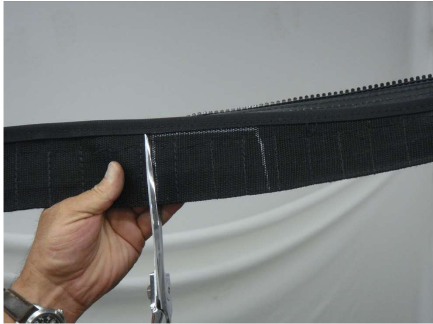
Cut the Tab being very careful not to cut the binding at the edge