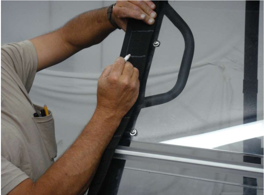
Mark windshield tabs where hard windshield clamps are located along the windshield Roll Bar

Step 6: If the front tab needs to be cut to accommodate windshield clamps, please use the following instructions.