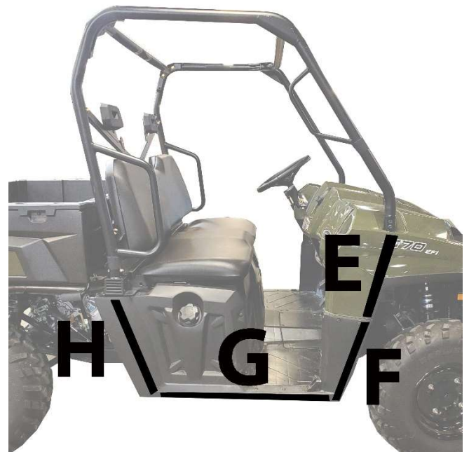
Figure 2: Strips E and F are a little longer than needed, you can trim these pieces to fit.