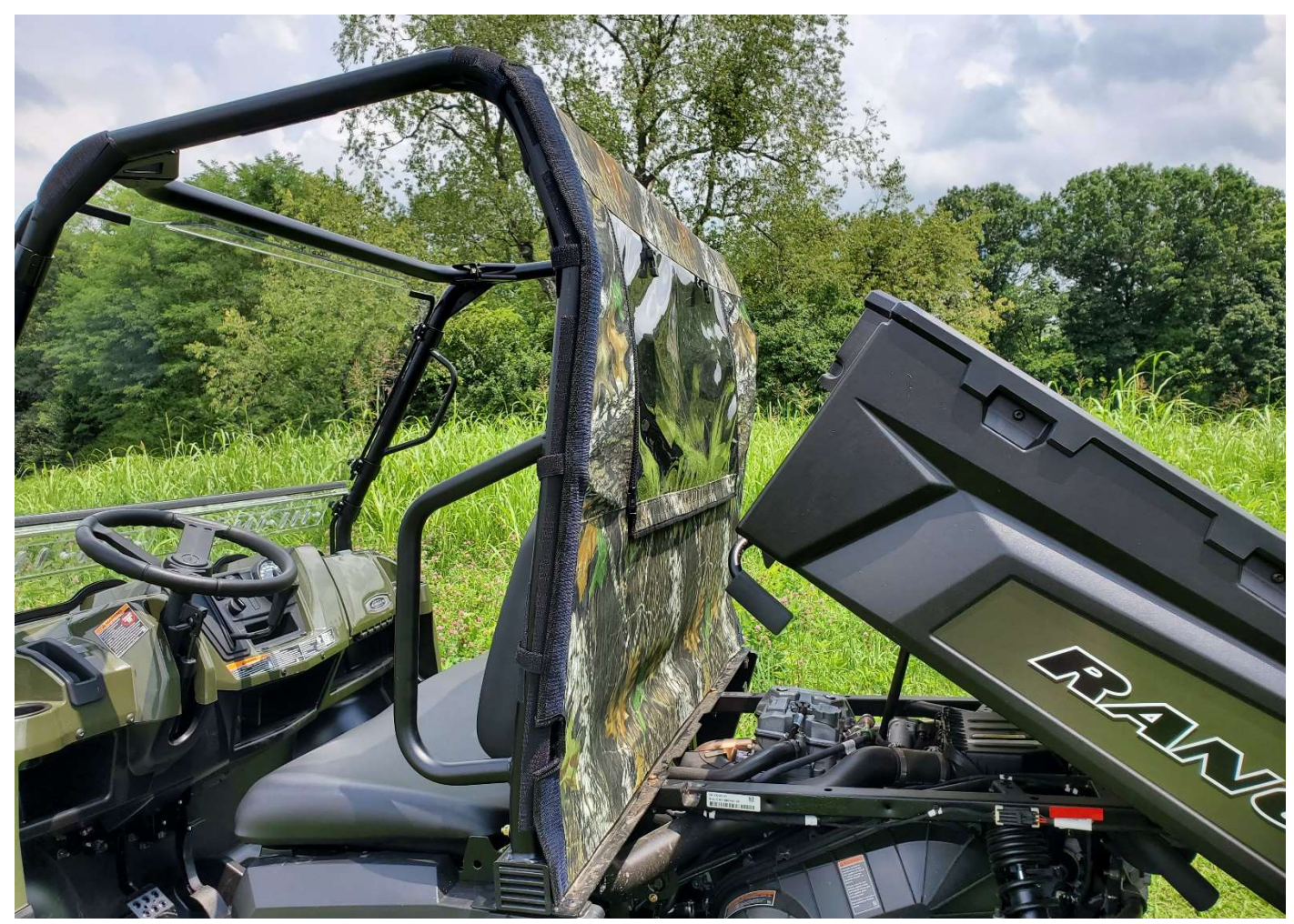
Figure 3: The double sided straps on either side of the back panel wrap around the roll bar and attach to themselves. You may choose to attach a little adhesive hook to help hold the back panel down but this is not necessary.