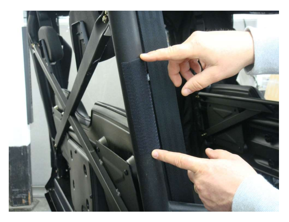
Figure 3.1 attach 8" Velcro strips vertically on the Rear Roll Bar uprights

Step 3: Remove the clear plastic backing from the 8 " Velcro strips and install vertically near the center of the Rear Roll Bar Uprights as shown in figure 3.1. Note Velcro Strips should face away from the center of the cab.