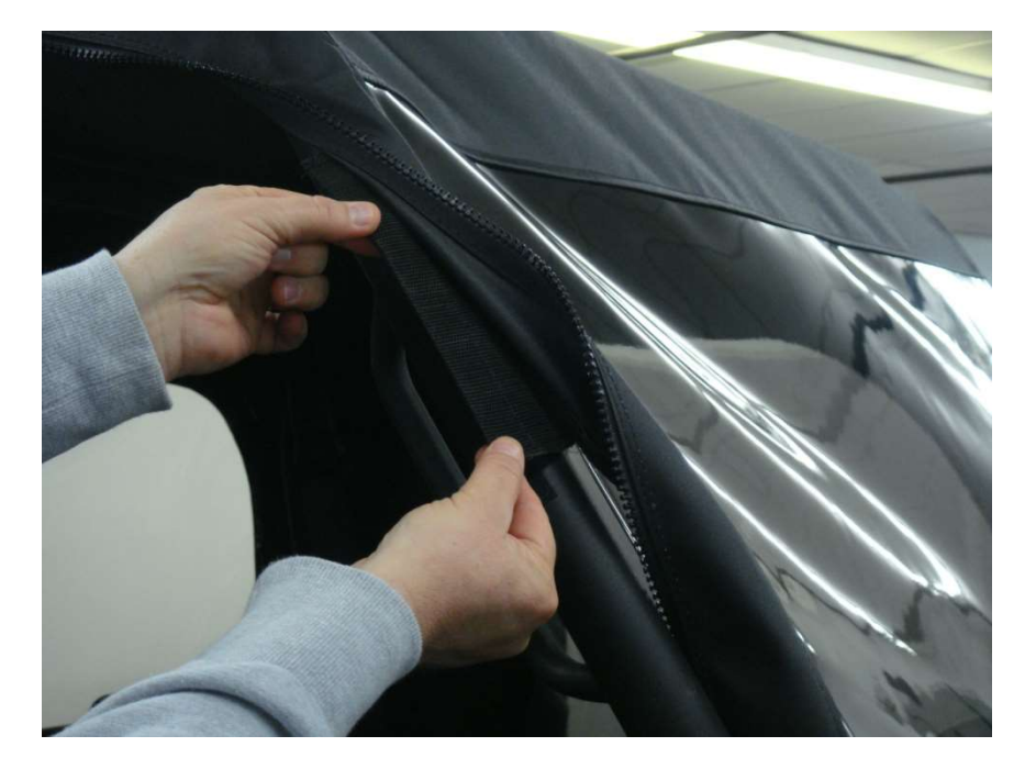
Figure 8.1 – attach Top 10" Windshield Velcro Tabs

Step 8: Pull the enclosure (each side of the front windshield) downward toward the front of the vehicle and attach the 10" and 5" Windshield Upright Enclosure Velcro Tabs to the installed Front Windshield Roll Bar Post Velcro strips as shown in figure 8.1, 8.2 and 8.3. This Step is best performed with an assistant attaching the Windshield Velcro Tabs on each side of the Windshield at the same time.