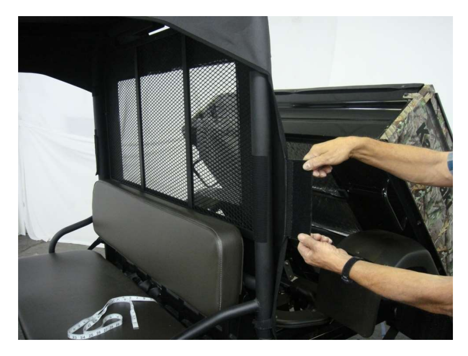
Figure 7.1 – attach rear Roll Bar Post upright 8" Velcro tabs

Step 7: Place Enclosure on top of the vehicle Roll Bar Cage making sure that top seams are aligned with the center of the Top Side Roll Bars. Keeping the Seams aligned with the Roll Bars and the rear of the Enclosure square to the rear of the vehicle cab frame. Attach the bottom of the rear panel to the 59" Velcro strip. Pulling upward and outward on the 8" Enclosure Velcro tabs, attach to the installed 8" Rear Roll Bar Post Upright Velcro Strips as shown in figure 7.1. Also attach Middle Roll Bar upright post Velcro tabs around installed 6" Velcro strips as shown in figure 7.2. Note these steps should straighten out the rear window panel.