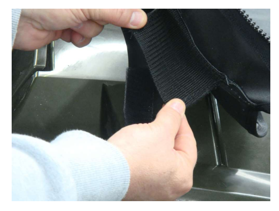
Figure 8.3 – attach bottom 5" Windshield Velcro tabs

Step 9: Attach the 7" and 30" (1" wide) Front Hood Enclosure Velcro tabs underneath the Hood to the installed Velcro Strips. The Front of the vehicle Windshield should look like figure 9.1.