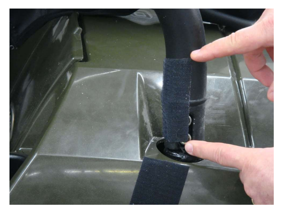
Figure 5.3 – install 5" Velcro Strips vertically along the bottom of the Front Windshield Roll Bar uprights

Step 6: Open the Hood of the Vehicle, remove the clear plastic backing from the 7" and 30" (1" wide) Velcro Strips and attach on the inside lip of the Hood support. 7" strips go the right and left of the 30" strip.