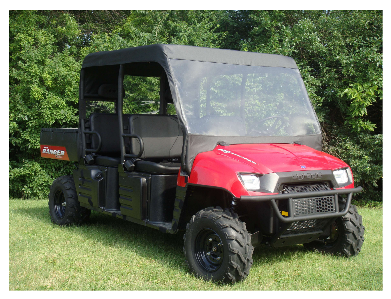
Figure 9.1 – Windshield should be tight at this step of the installation

Step 9: Attach the 7" and 30" (1" wide) Front Hood Enclosure Velcro tabs underneath the Hood to the installed Velcro Strips. The Front of the vehicle Windshield should look like figure 9.1.