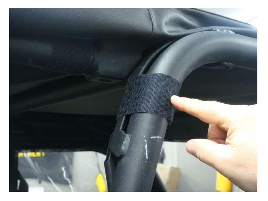
Figure 4.1 - install 11" Velcro Strips horizontally around Center Roll Bar uprights at the top

Step 4: Remove the clear plastic backing from the 6 " Velcro strips and install horizontally around the Center Roll Bar Uprights at the top as shown in figure 4.1. Note Velcro Strip seams should face the center of the cab.