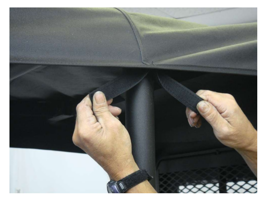
Figure 7.2 - attach Center Velcro tabs to installed 6" Velcro Strips