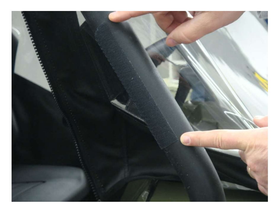
Figure 5.2 – install 10" Velcro strips vertically along the middle section of the Front Windshield Roll Bar uprights